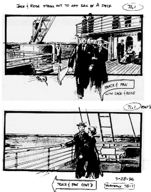
Fig. 2.1 TITANIC storyboards (1997)

It is much more educational to purchase actual complete storyboards from well known films on Ebay and analyze them for shot continuity and visual storytelling. The characters in live action storyboards may bear little or no resemblance to the actors who play them. They are used solely as guides for the mood and the actors' and camera's placement in each shot. A lengthy film like TITANIC has a storyboard that is only about 200 pages long, containing about 400 panels. Each panel illustrates a shot, not the acting within the shot.