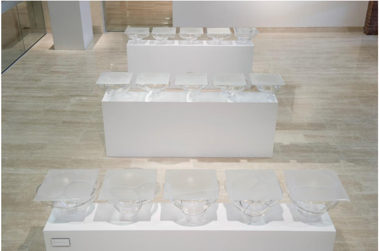
Embrace Glass, Wire H35×W66×D120 2014