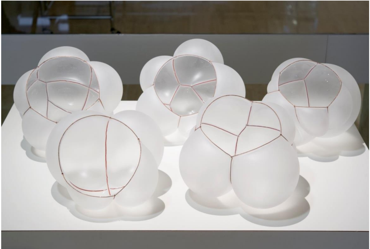
Ushari Glass, Wire H6×W15×D25 2013