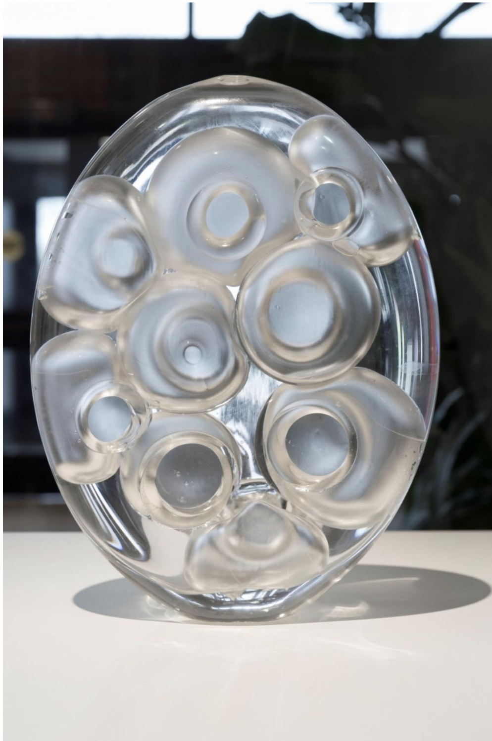
Gyu-Gyu III Glass, Water H12×W9×D2 2014