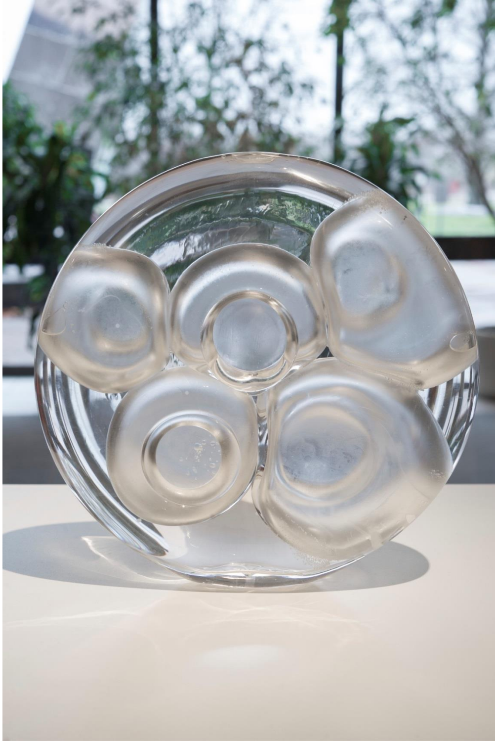
Gyu-Gyu II Glass, Water H10×W10×D2 2014