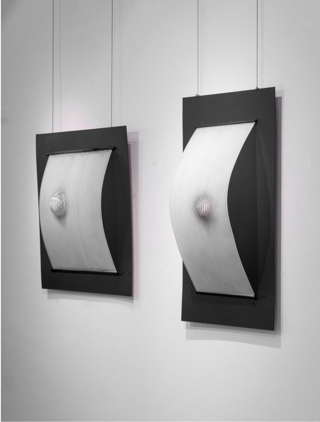
Surfacing Glass H34×W55×D9 2014