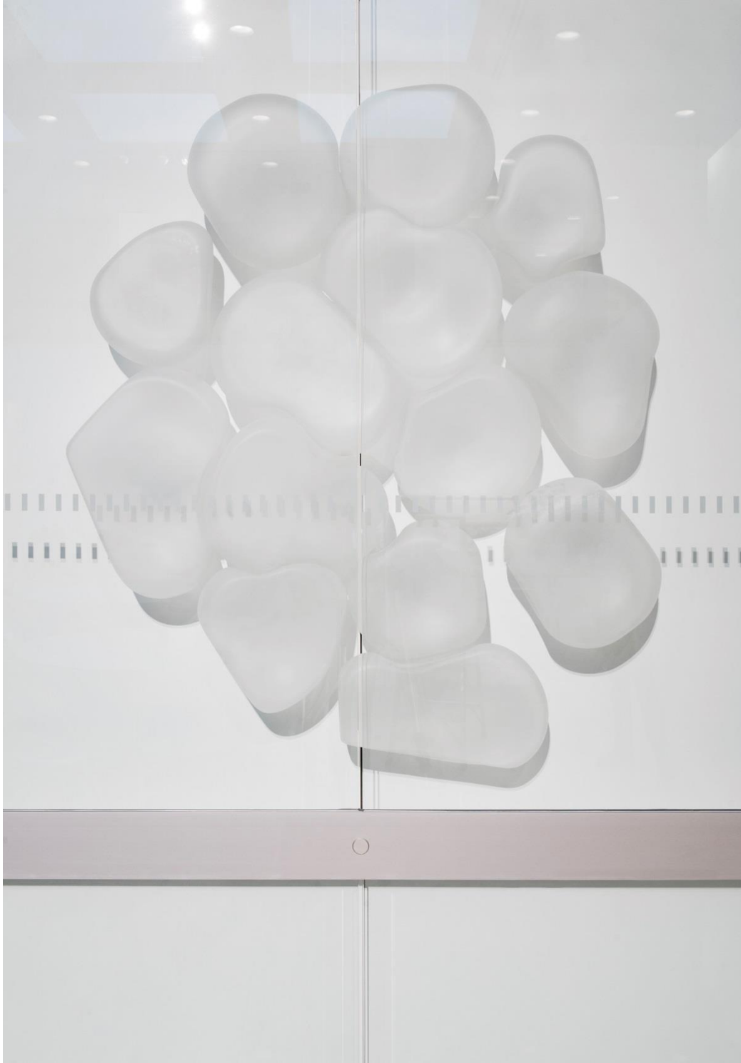
Gyu-Gyu I Glass H80×W75×D12 2014