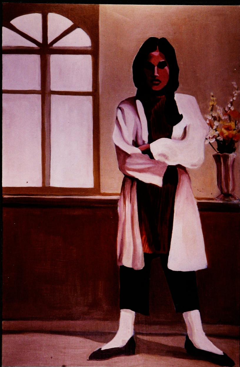
The Soothsayer 22" x 36"