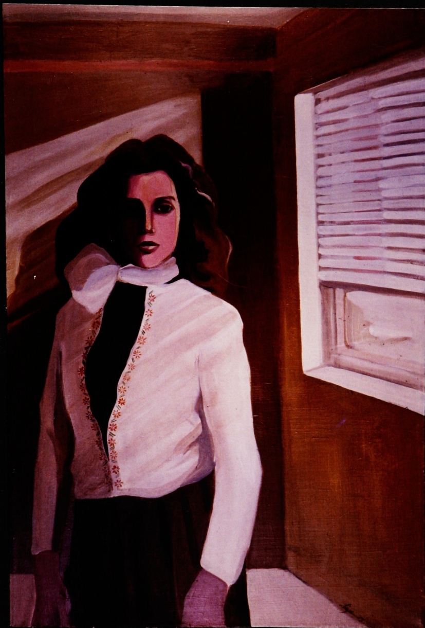
Prophetess 26" x 40"