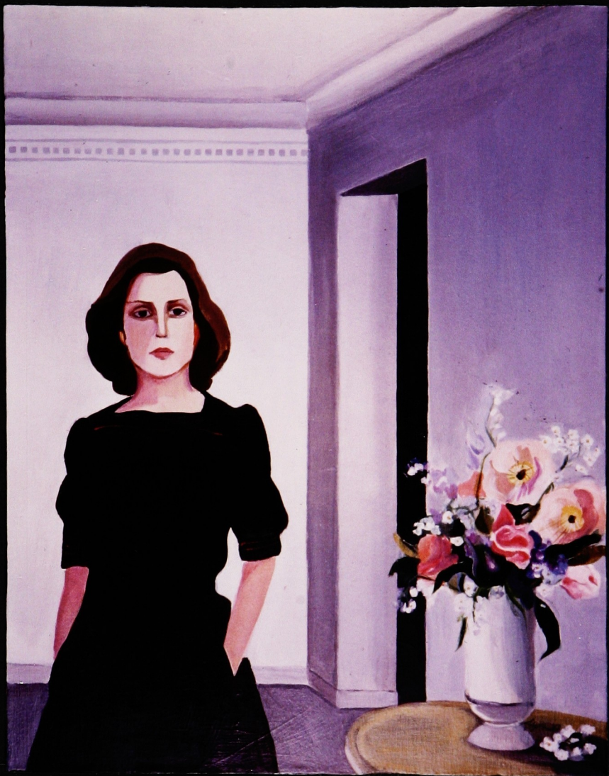
Sibyl 22" x 26"