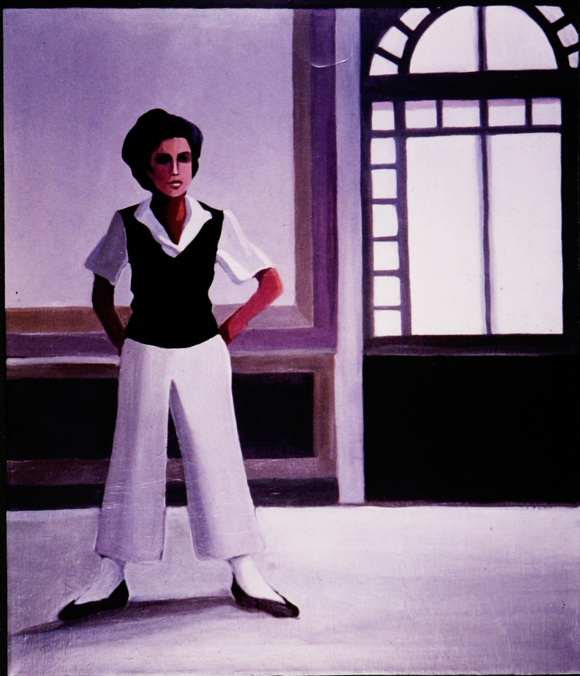
Omen 32" x 34"