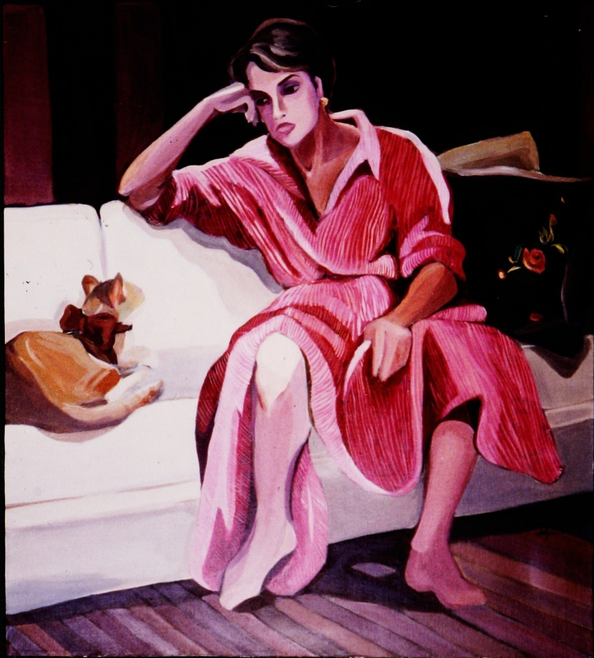
Wisdom of the Cat 32" x 36"