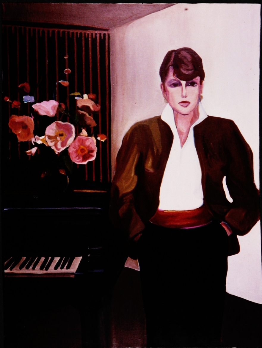
Musician 30" x 40"