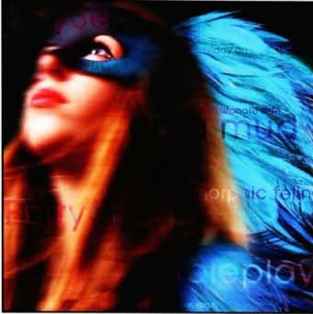
Friday, 20x20" Iris Print on Canvas

Description (DESC): Friday is a female character. An anthropomorphic feline who embodies my more passionate side. (Passionate not being restricted to a sexual connotation, but meaning strong emotion of all sorts: anger, love, rage, sorrow...etc. As opposed to apathy or ennui.) She also is a vent for aspects of my personality repressed in Real Life, including but not limited to sexual practices.