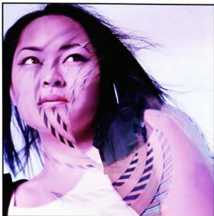
Shii, 20x20" Iris Print on Canvas

Description (DESC): Pacifist Medical Doctor in the Star Wars Universe who's personal hobby is using explosives to turn buildings into artistic designs. She's got skin of a light orchid color with darker purple hair. Her 'attributes' are nothing remarkable. Waist and Hips are close to the same size so she definitely doesn't have the 'idealistic' hourglass shape. She abhors violence and finds that it usually creates more problems than it solves. She's a member of the New Republic Military, but only so that she can use her medical skills to help the greatest number of people.