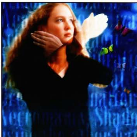
Eliara Starrunner, 20x20" Iris Print on Canvas