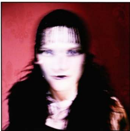
Diablerie, 20x20" Iris Print on Canvas