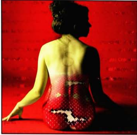
Kylariss Sslesthli, 20x20" Iris Print on Canvas

Description (DESC): (Star Wars Universe: Sluissi Species) Kylariss is in her early 20s. Her snakelike figure has an odd delicacy to its form. The upper body is humanoid, the skin an olive green color. From the waist down, the body becomes serpentine, tapering out to a single scaled tail. Kylariss is a recently appointed senator from Sluis Van but grew up in the city of Ssenessa. She's very shy and quiet. A tech-wizard, to be exact--and a perfectionist who wants to feel useful but always downplays her skills. When something happens and no one else around seems to be taking charge however, a leader will emerge, issuing quiet orders without seeming to realize it. Very compassionate, she would help her enemies as well as her friends, a pacifist, she prefers to talk then fight.