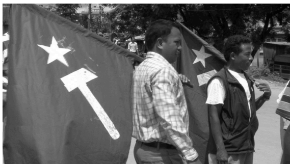
Maoist rally on the streets of Kathmandu