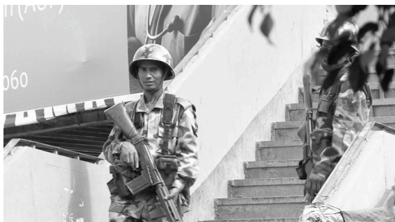
Armed soldiers in the heart of the city