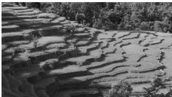
Asmita's ancestral village in Gorkha district