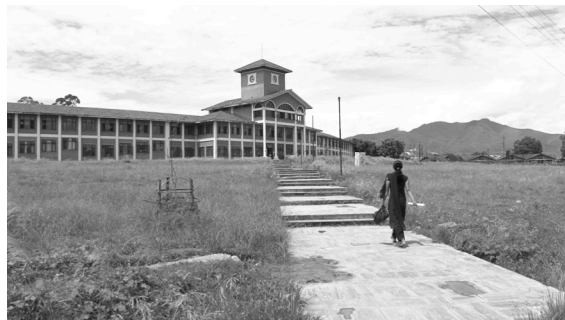
Tribhuvan University, Bhaktapur campus