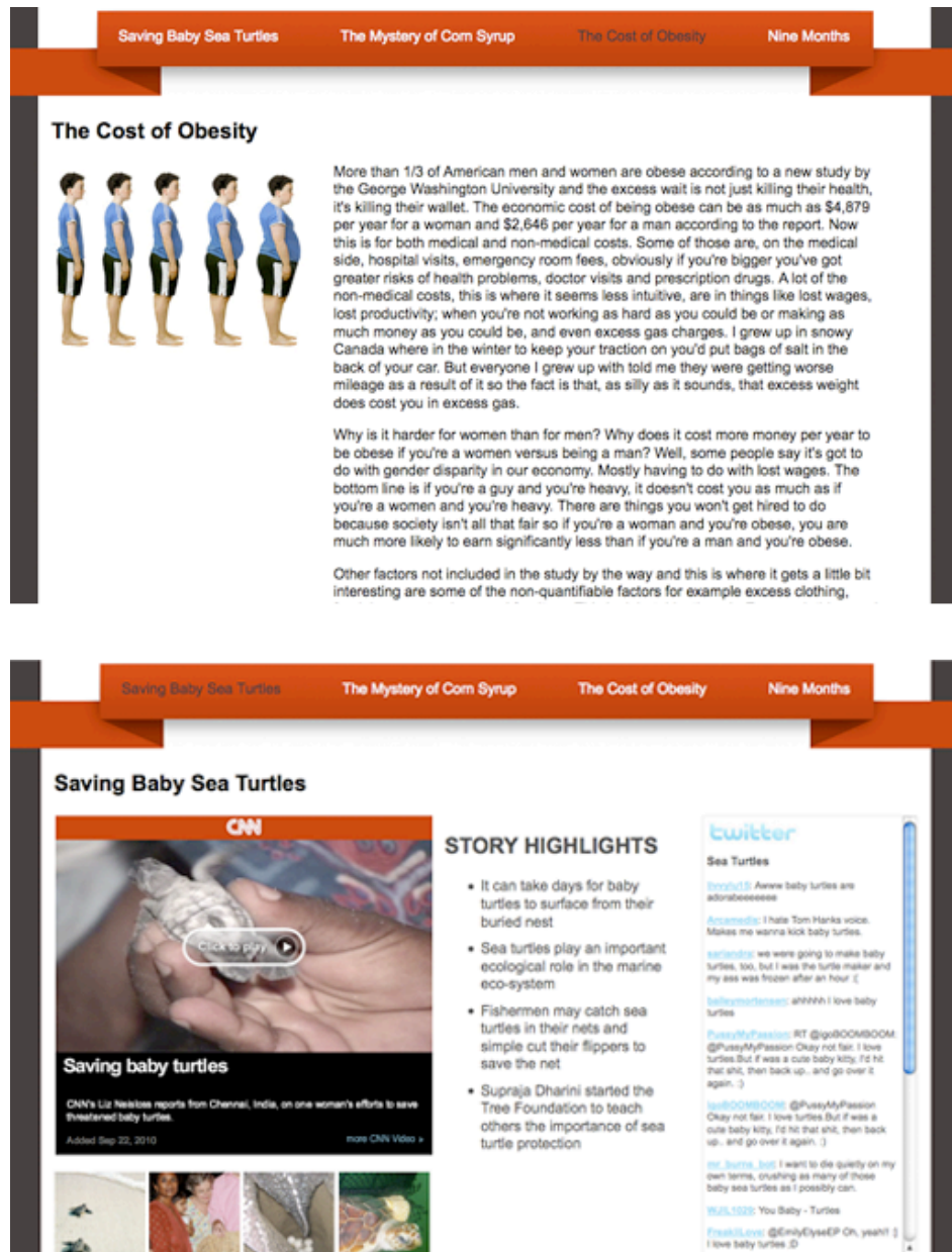
Figure B1: Control articles: