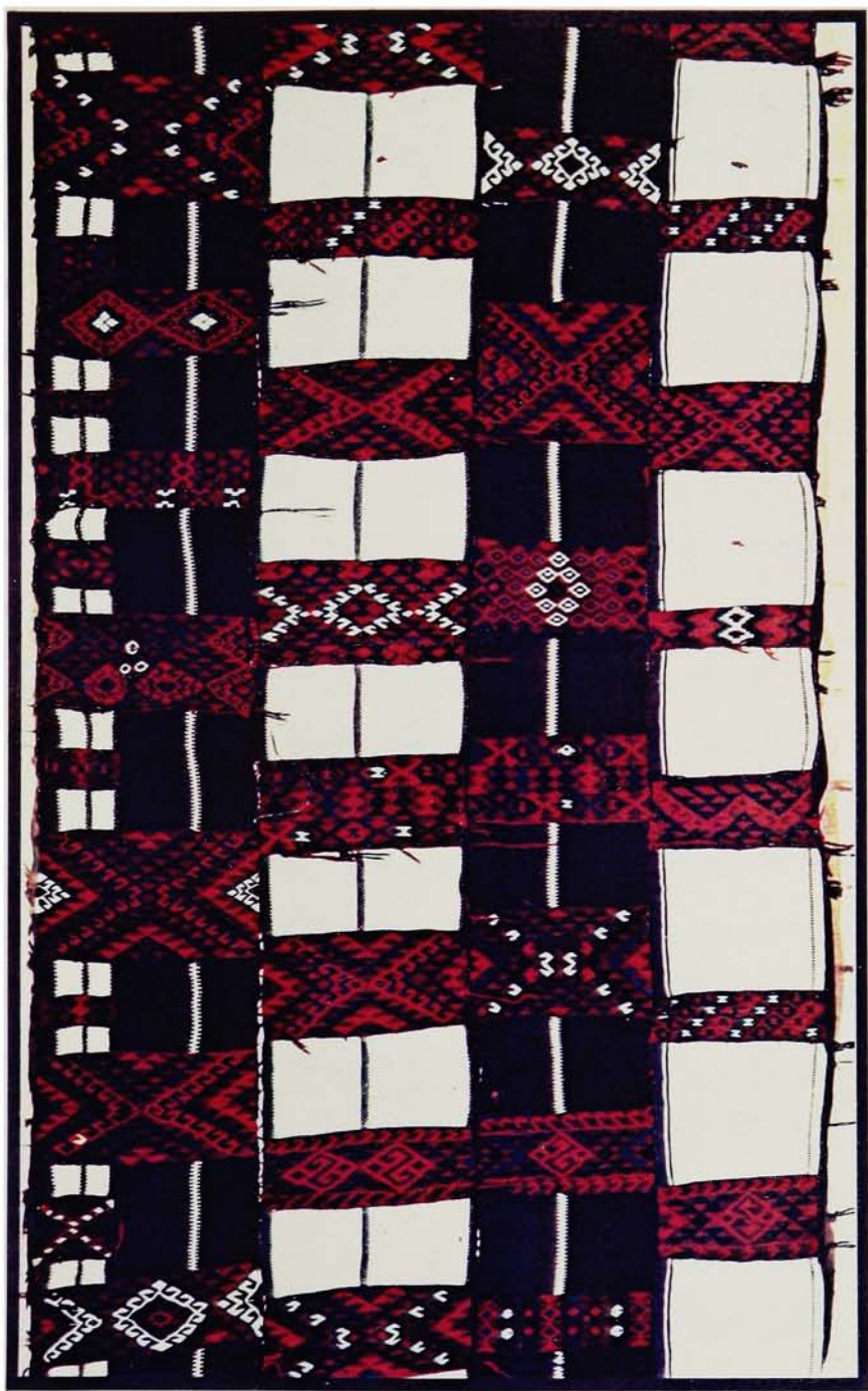
A portion of a tent dividing curtain woven in strips and alternating areas of warp-faced plain weave and welt-faced twined tapestry. Collection of John M. Topham.