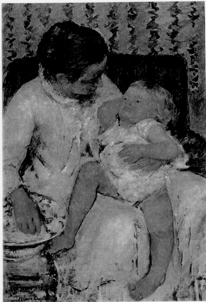
Mother About to Wash her Sleepy Child Mary Cassatt