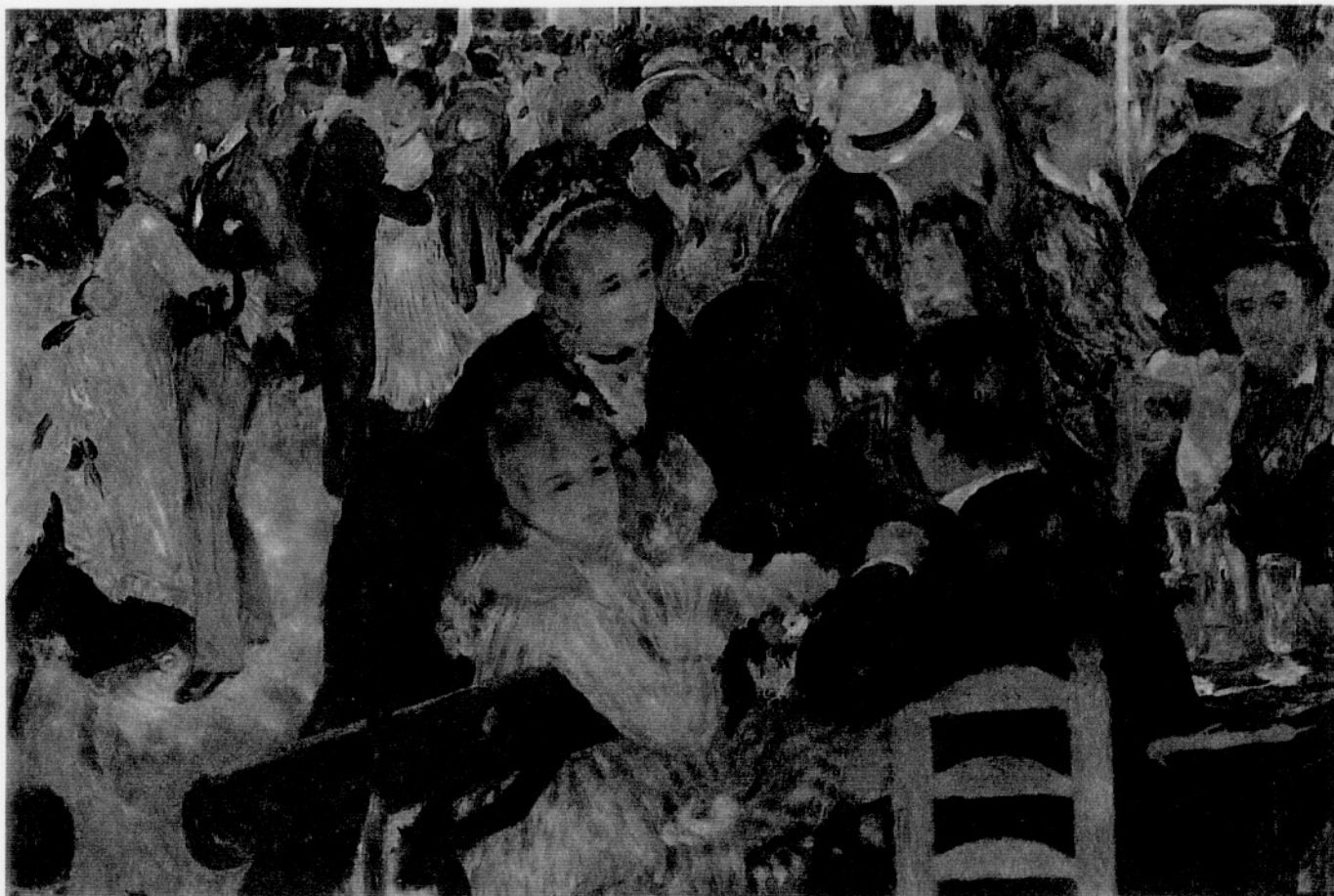
Moulin de la Galette Pierre-Auguste Renoir