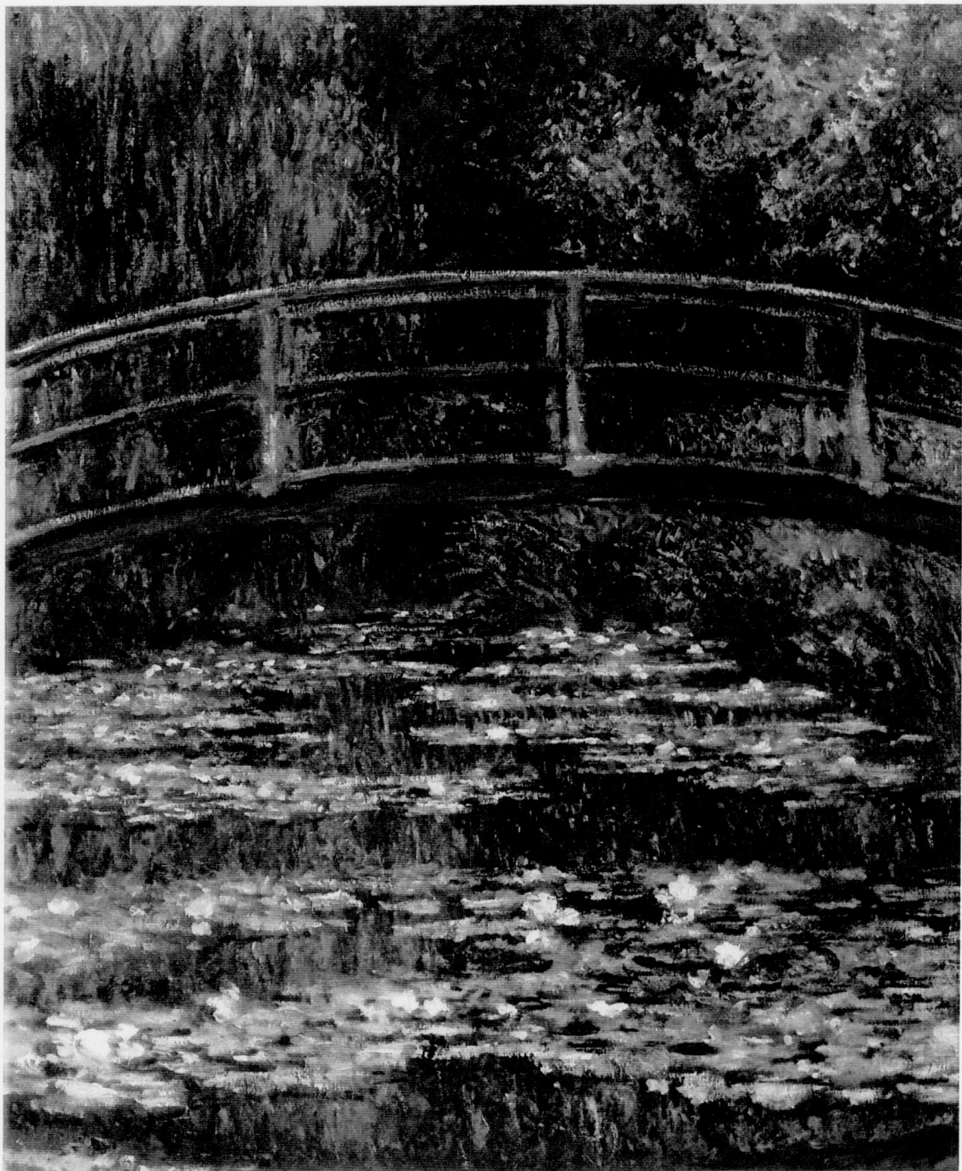
Bridge Over a Pool of Water Lilies Claude Monet