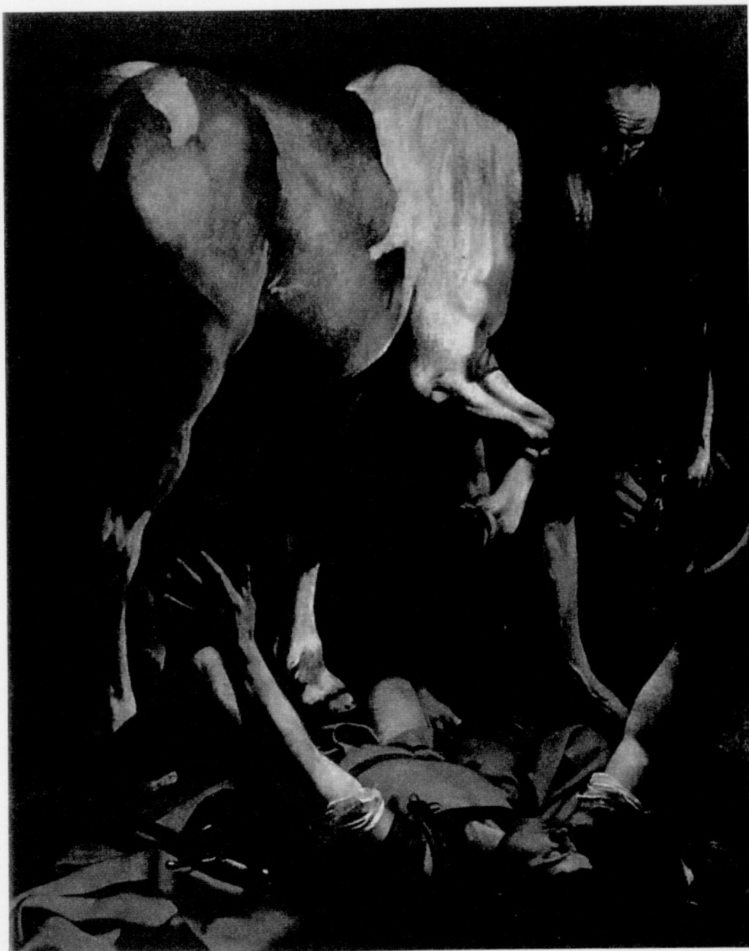
The Conversion of St. Paul Caravaggio