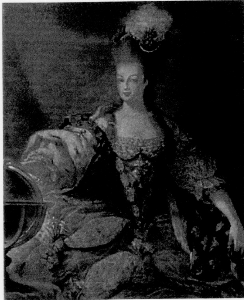
Marie Antoinette Jacques Gautier d'Agoty