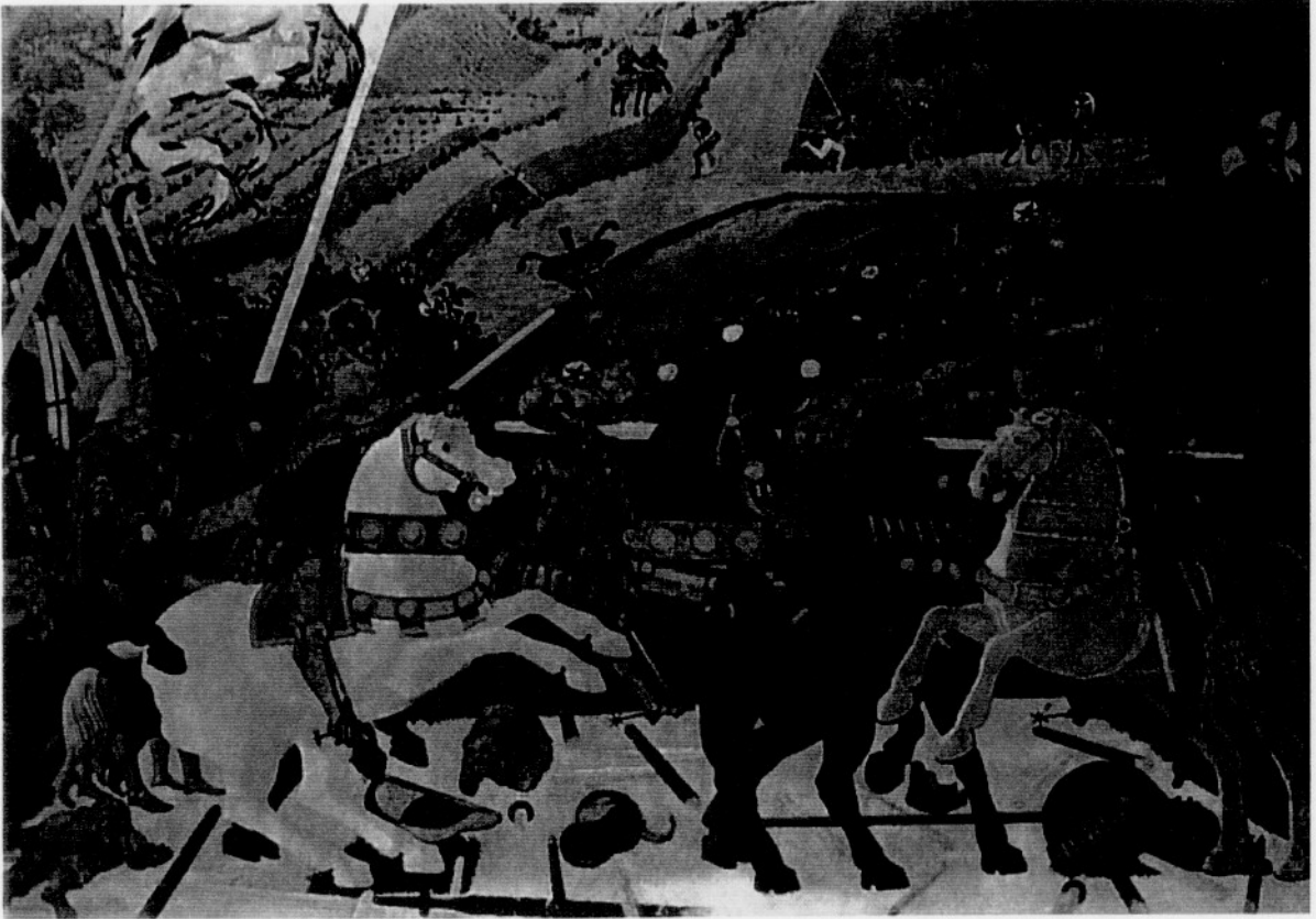
Battle of San Romano Paolo Uccello