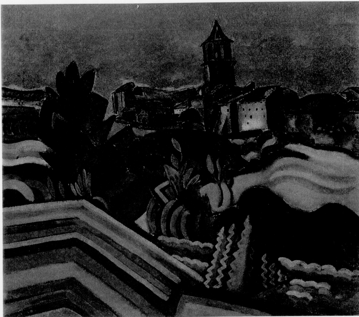
Prades, the Village Joan Miró