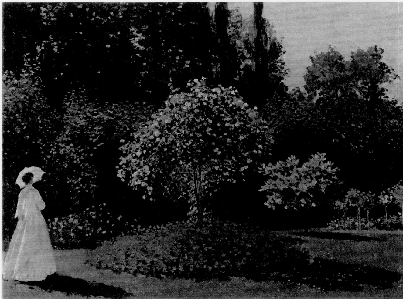
Woman in a Garden Claude Monet