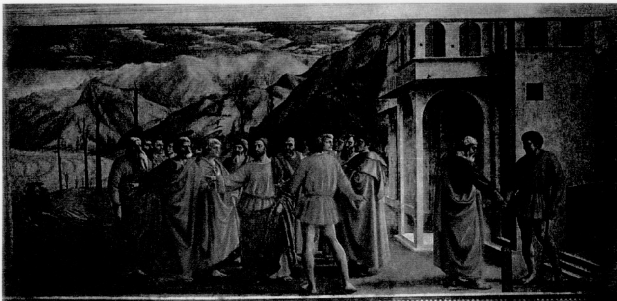
Tribute Money Masaccio