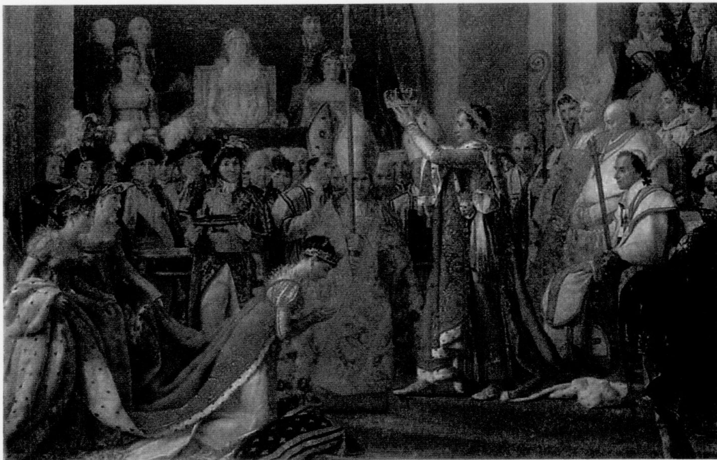
Le Sacre de Napoléon I Jacques-Louis David