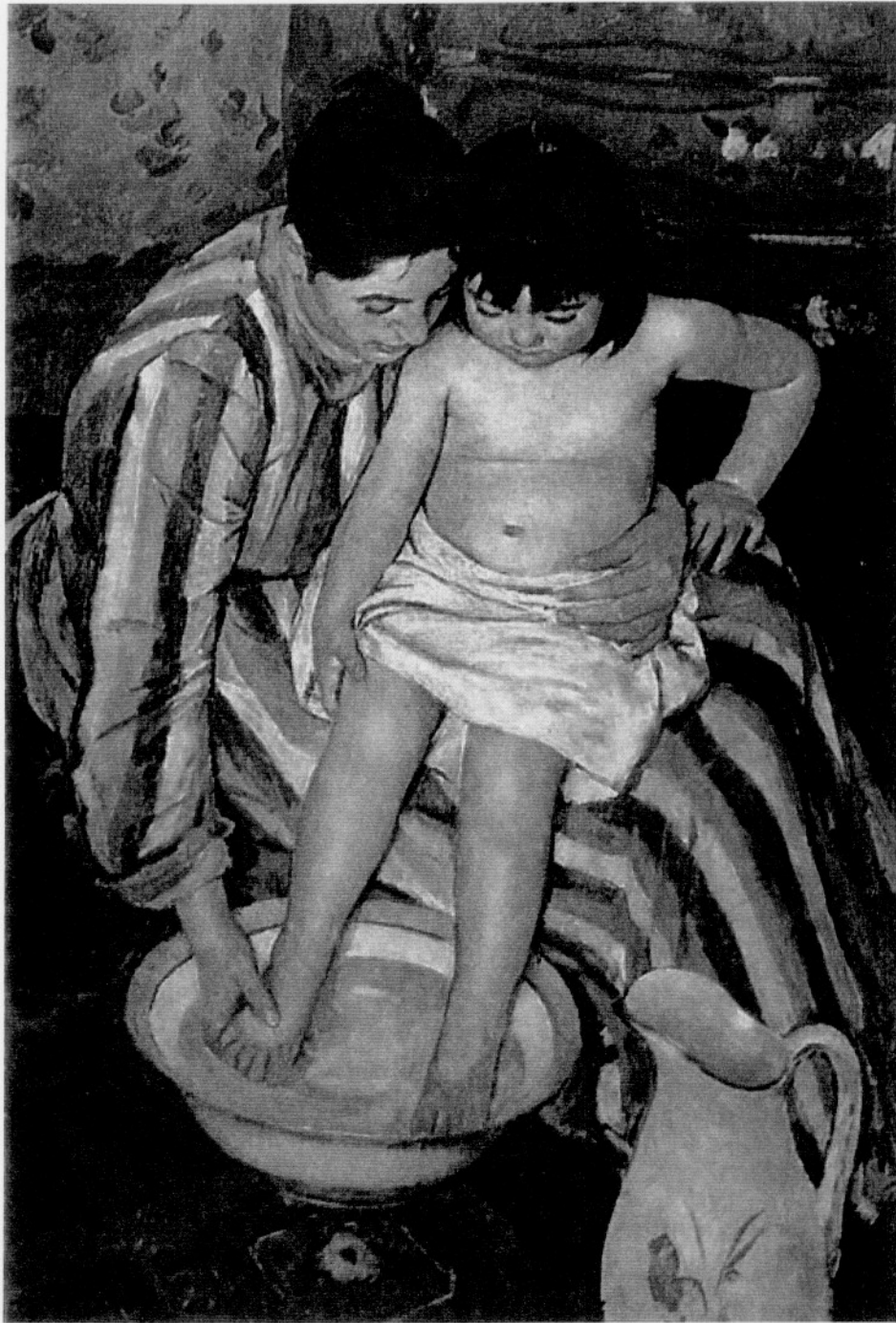
The Bath Mary Cassatt