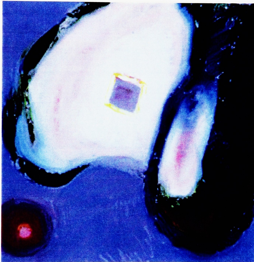
Untitled H2, 22" x 22". Oil color, Latex and Acrylic color