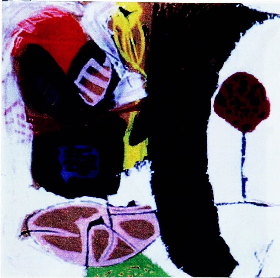
Untitled H3, 24" x 24". Latex color, crayon and Mix media.