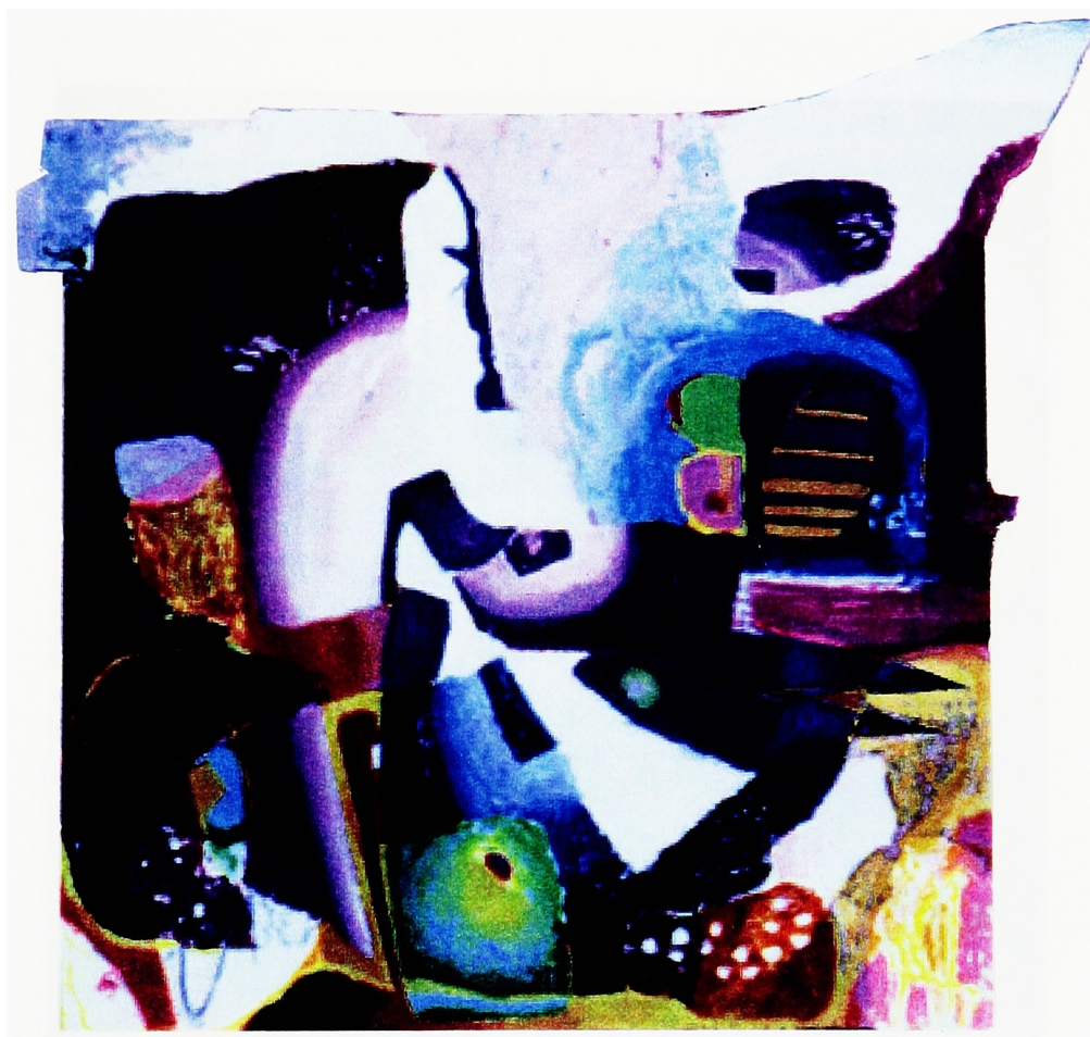
Harmony IV, 24" x 24". Oil color, Acrylic color and Mix media.