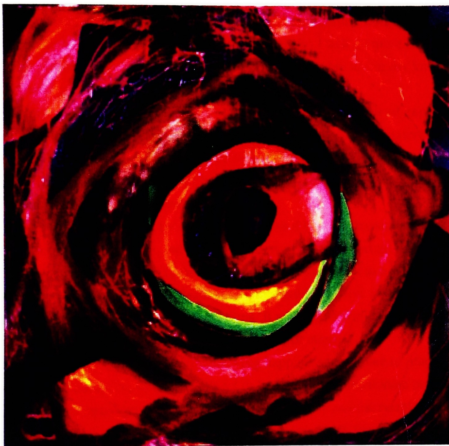
Harmony VIII, 33" x 33". Oil color, Latex and Acrylic color.