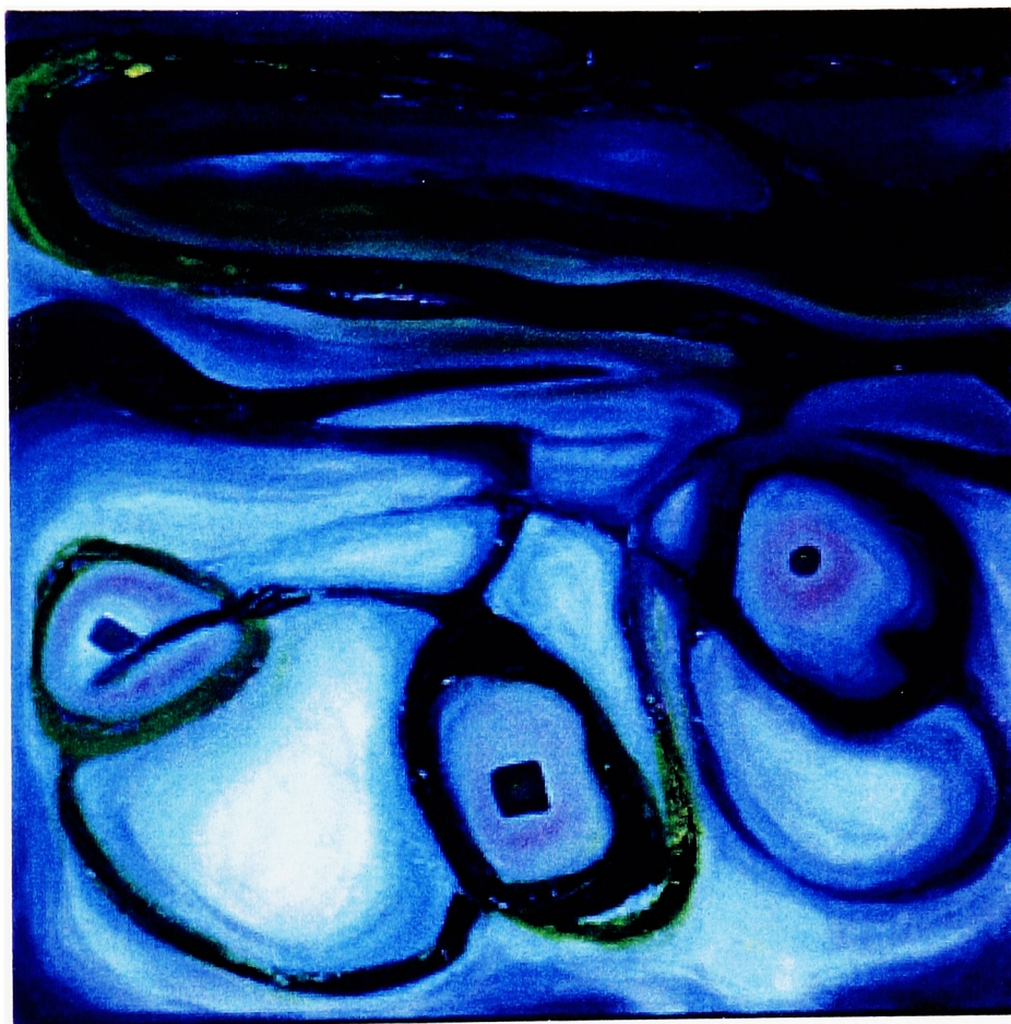
Harmony VI, 33" x 33". Oil color, Latex and Acrylic color.