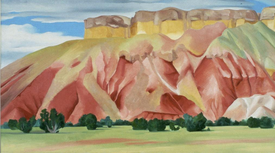
Figure 2. O'Keeffe, Georgia, My Backyard , 1937. Oil on canvas, 20 x 36in. New Orleans Museum of Art, Louisiana, The Image Gallery Collection (ARTstor digital library 3/10/2008).

Both Carr and O'Keeffe have the sense of centering in a place. O'Keeffe's descriptions of New Mexico are stunningly accurate as seen in figure 2, My Backyard .