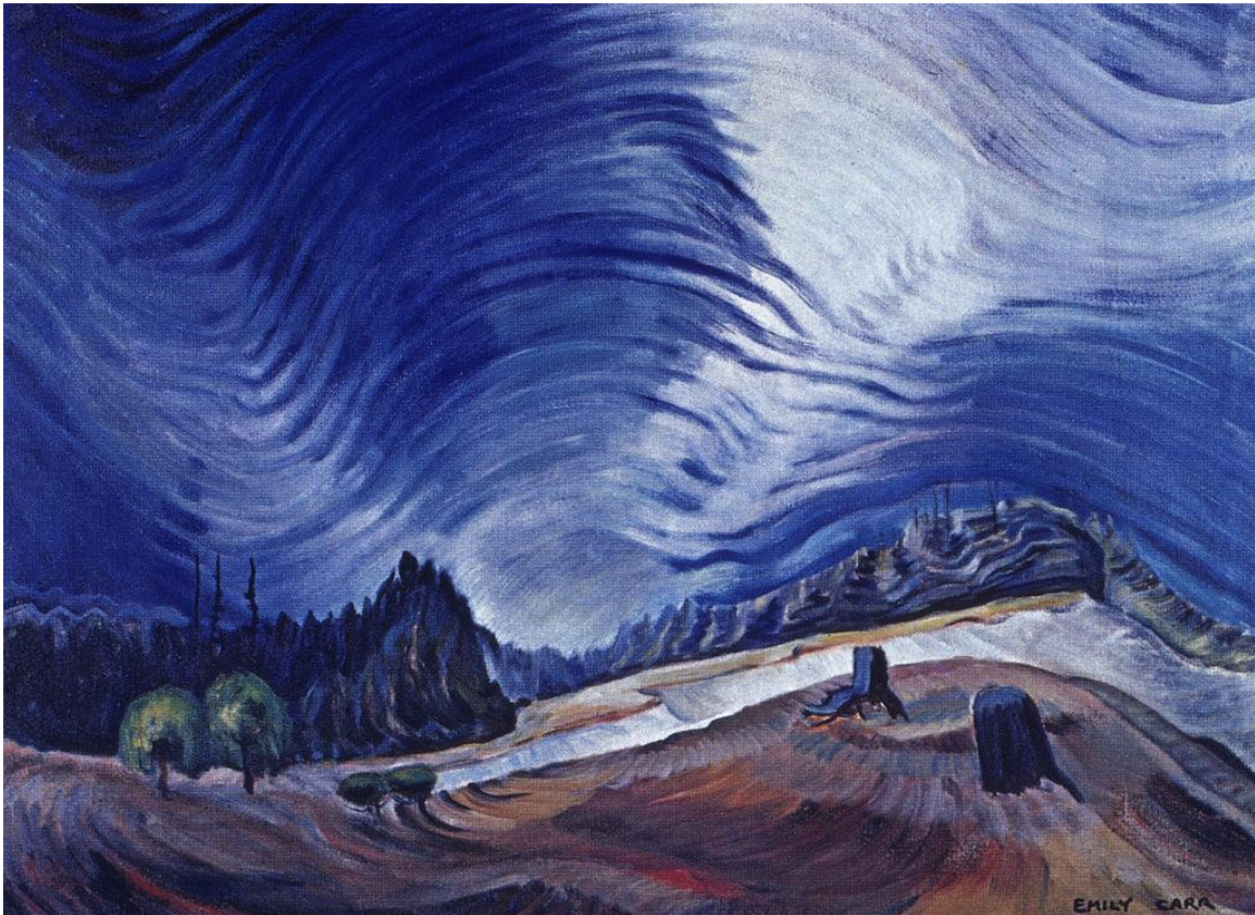
Figure 1. Carr, Emily, Above the Gravel Pit , 1936. Oil on Canvas, 30 ¼ x 40 ¼ in. Vancouver Art Gallery, Vancouver.

The painting Above the Gravel Pit figure 1, by Carr exemplifies this style. It is a freedom of color and brushwork that I crave within my own paintings. I was struck by the sweeping descriptions and their simplicity paired with the complexity of color. The sky is moving and filled with energy. This influence translated into my own need to create a brush stroke filled sky within my work. I wanted to paint with the obvious exuberance of this work but found I had only part of Carr’s liberty.