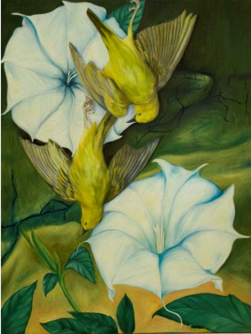
Figure 4. Mance-Coniglio, Melissa, For G and A, Over New Mexico , 2007. Oil on canvas, 36 x 48in. Collection of the artist.