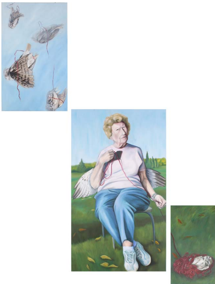
Figure 7. Mance-Coniglio, Melissa, Atropos (In Memory of b. Shultz) , 2008. Oil on canvas, 93 x 118 in. Collection of the artist.