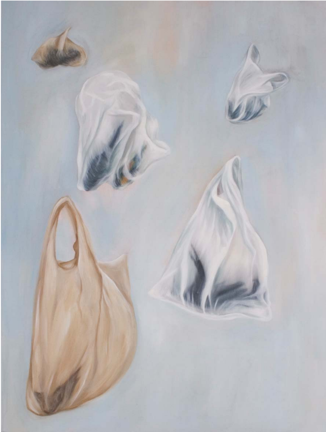
Figure 9. Mance-Coniglio, Melissa, J's Bags , 2008. Oil on canvas, 36 x 48in. Collection of the artist.