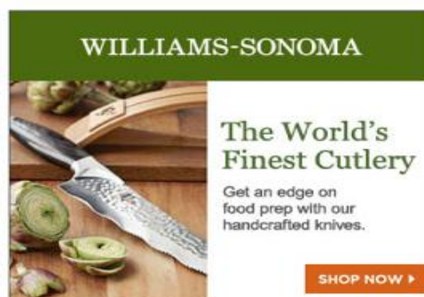
Figure 3. Bordered Text – Flickr

Most ads were seen with borders, such as the Williams-Sonoma ad on Flickr.com in Figure 3. The way ads are styled can be related to site structure and page layout. Effects research can be conducted to test the click-through rate for bordered ads vs. non- bordered ads.