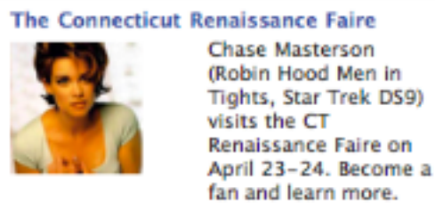
Figure 1. Floating Text - Facebook