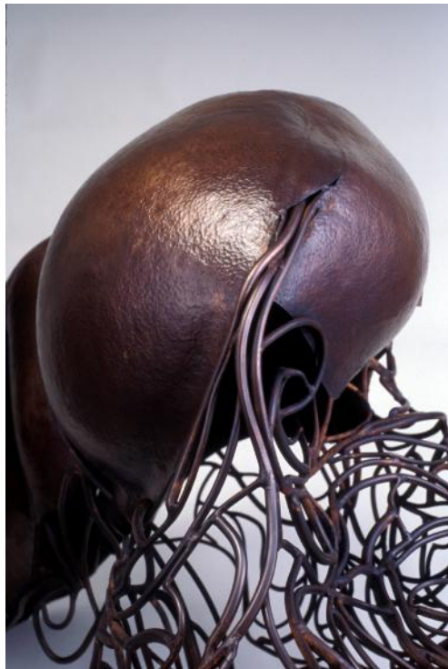
fig 3. detail of Chrysalis , 2007 copper, 50 x 29 x 25 inches