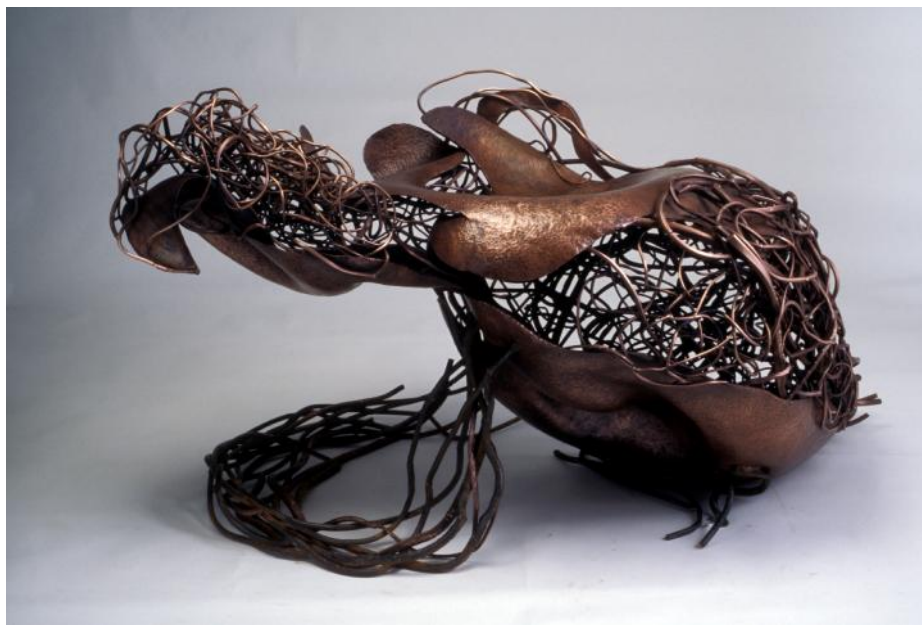
fig 6. In Gestation , 2007 copper, steel, 47 x 26 x 24 inches