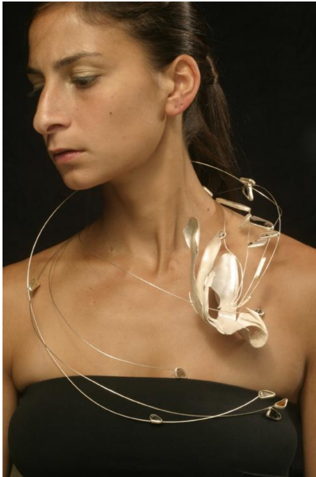
fig 8. Ring or Not sterling silver, agate 12 x 12 x 12 inches