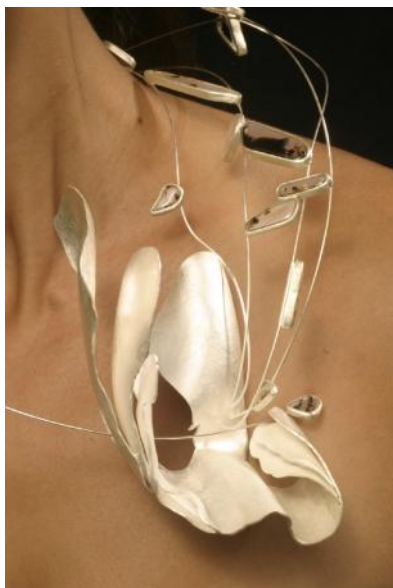
fig 9. detail of Ring or Not sterling silver, agate, 12 x 12 x 12 inches