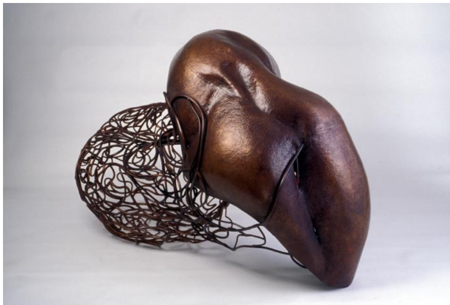
fig 4. Chrysalis , 2007 copper, 50 x 29 x 25 inches