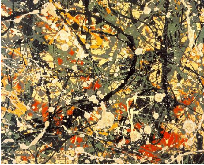
fig 13. Jackson Pollock Number 8 , 1949