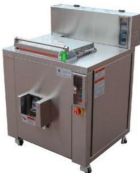
Figure 2. Ecovim-66 system.

We determined the major opportunities for end markets and performed a detailed literature review to ascertain how the Ecovim-66 output material could be used, based on key characteristics needed. For each potential end market use, we defined “optimal” ranges of key parameters. For example, feed for dairy cows requires carbohydrate and protein levels to be within a certain range. Using the data collected by Dairy One, the characteristics of the output materials were compared to these ranges to determine if the dehydrated food was a potential match for that end market. Qualitative information was also included in the analysis where appropriate. Though food safety would be an important requirement in utilizing the dehydrated material in animal feed markets, analysis specifically related to food safety was outside the scope of this assessment.