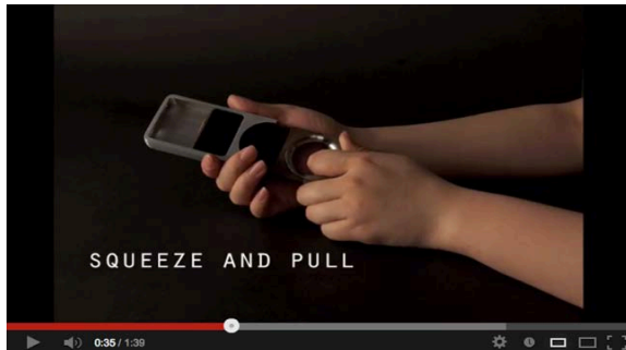
Figure 1: Revolve phone's video.

Link to Video: http://youtu.be/aP6ybB2KNI0