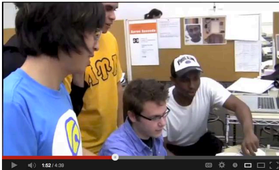
Figure 4: Squat sanitation system's video.

Link to Video: http://youtu.be/g7q-yzozJH0