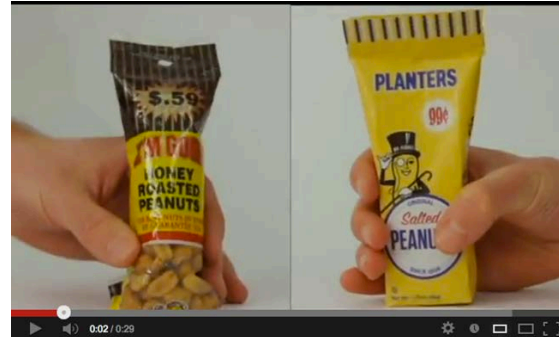
Figure 2: Planters packaging's video.

Link to Video: http://youtu.be/mqKoQ8Mvhy0