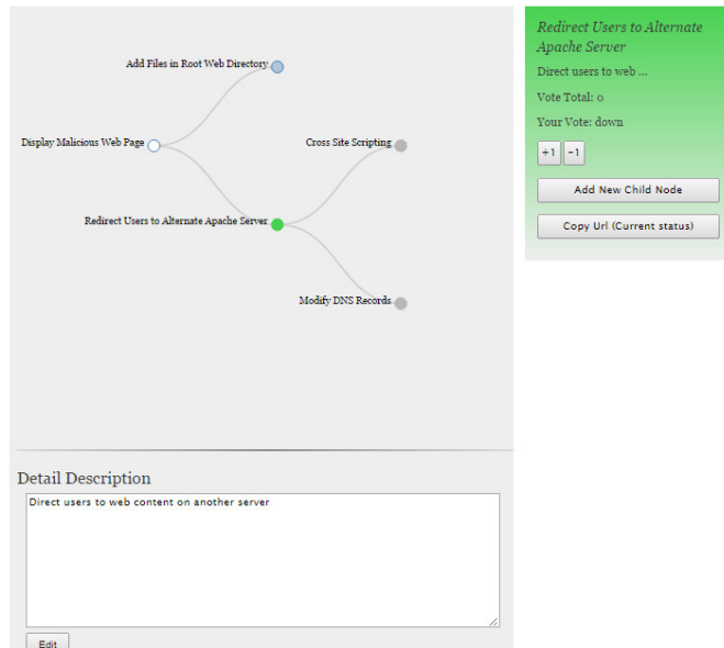
Fig. 3. Simple Attack Tree in RATCHET

node in the tree has an area for comments and the capability of allowing users to vote in favor or against it. Each node and comment area is editable by the creator of the node and the administrators of the system to ensure their validity. Unregistered users will be allowed to interact with the system and view existing trees. Some users will be allowed to add a vote (up/down) to nodes to indicate their view of the relevancy or usefulness of that node.