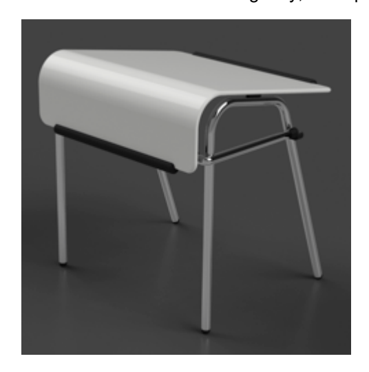
Figure 5. Bullet-resistant desk.

Michael Kelly, also a graduate design student at RIT, took an entirely different approach on designing for death. United States is suffering of an increased number of school shootings, which are causing countless deaths of innocent people and leave thousands others traumatized by the horrific acts. There has been significant discussion on why these acts of violence are so prevalent in U.S. society but there are many challenges in preventing them from continue happening. Kelly decided to connect school shootings with the project from the angle of someone facing their potential death and having to defend their life and perhaps even the life of others. In early stages of the project Kelly explored ways of fighting back a mass shooter but ended up avoiding the use of violence to prevent violence, focusing instead on providing safety. The solution is a desk workstation with a removable top made out of ultra-high molecular polyethylene, a lightweight, inexpensive, impact-resistant material. In case of an emergency, the top can be removed quickly and be used as a shield (Figure 5).