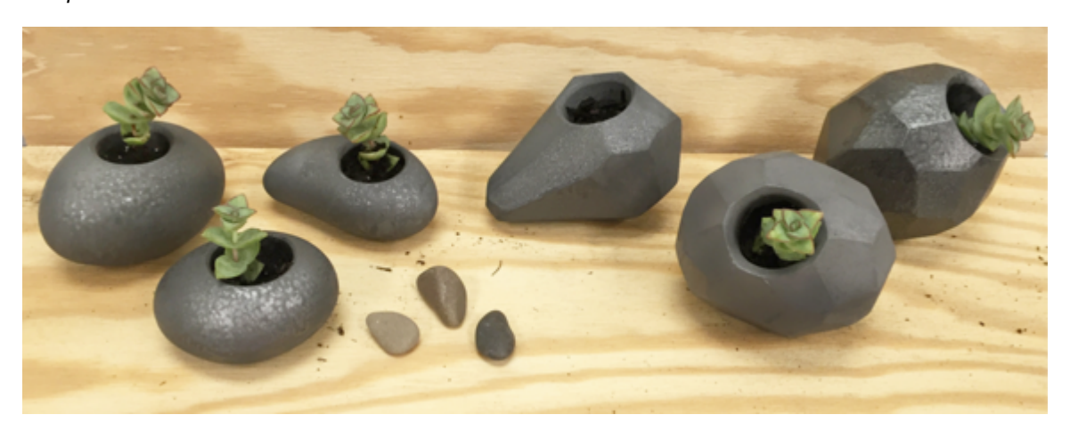
Figure 6. Stone Pots.