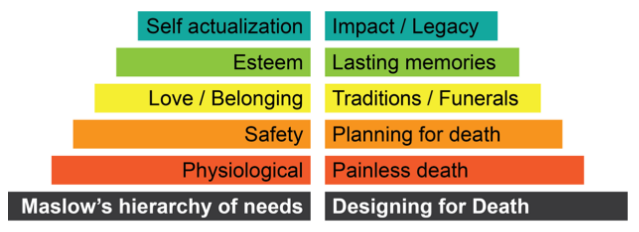
Figure 1. List of strategies for Design for Death according to Maslow's hierarchy of Needs

The apparent complexity of design for death might can be simplified by identifying key areas that need to be addressed. By taking Maslow's hierarchy of needs as point of reference, it is possible to categorize strategies that build up from basic tangible needs for survival up to more more complex, psychological ones (Figure 1).