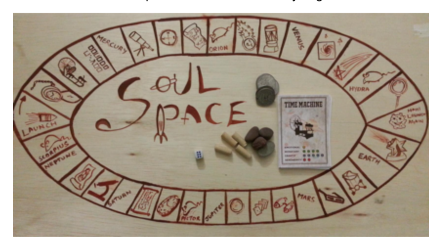
Figure 4. SoulSpace.

The watch measures time in two ways: The first one is the traditional way, telling the user actual time. The second one is a countdown timer set accordingly to the user's birthdate and life expectancy. As the user wears the watch he or she is reminded of how much time is left before a projected death. The goal of the watch is to make users mindful of how finite their time on earth is, encouraging them to engage in more meaningful activities. Akanksha Vishwakarma at RIT developed SoulSpace, a concept board game that makes people aware of their material possessions and how they might be distributed after their death (Figure 4).