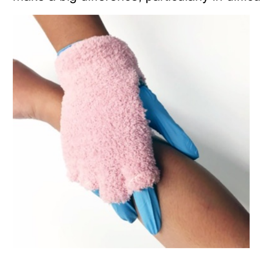
Figure 2. Palliative care bathing glove.