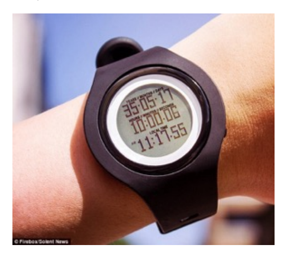
Figure 3. Tikker watch.