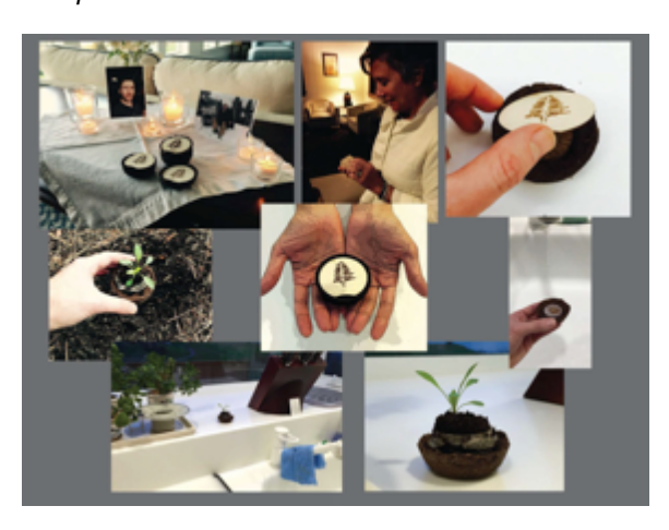
Figure 9. Heart Tender at multiple stages of use.

For Patton it was important to address key moments that people go through during and after a funeral so that this vessel wouldn't feel out of place. Several stages of product interaction were carefully considered so that people had enough flexibility to do with the box whatever they felt would make more sense for keeping the memory of a loved one alive. From a small, round shape that can be put in a shirt's pocket to an attractive, neutral appearance that could look good on top of a mantel to materials that would degrade easily if people decided to plant it, all of these features go back to how people can keep someone's memory alive. Heart Tender's shape is also result of experimenting with the peat plaster in order to find shapes that were molded easily and that wouldn't crumble away while handling them. The result is a simple but effective symbol that leads to the creation of new life. This is an innate ability that designers have, one where topics laced with fear such as death can be transformed into joyful moments that endure (Pallister, 2015).