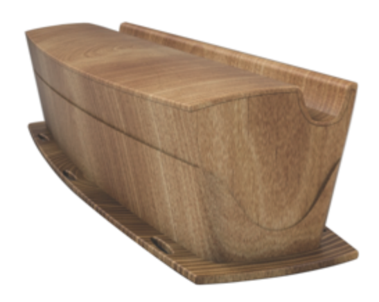
Figure 8. Sustainable coffin.

RIT student Elizabeth Stegner wanted to explore simple casket design that paid strong attention to materials selection. Her design concept named Cocoon uses ebonizing molded cardboard, which provides enough structural integrity during a funeral and burial but once is in contact with the soil it degrades easily (Figure 8). Another element that Stegner explored as a formal language that was accepted by a wider segment of users. While sustainable burials are gaining popularity, people still perceive them as geared towards environmentalists. Cocoon tries to find a balance between finding a casket that is simple but still acceptable for mainstream funerals. Cocoon's form shows a clean and elegant approach to the traditionally more ornate casket but maintains an elegance that is appreciated when burying a loved one.