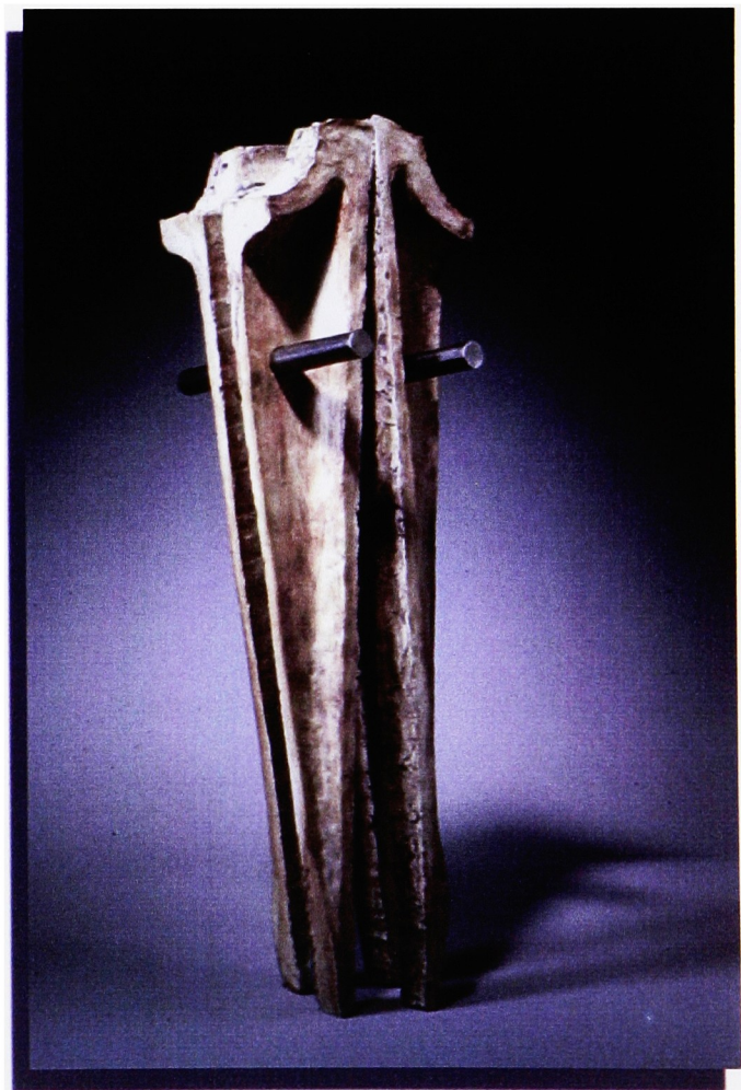
ONE Clay and Stainless Steel 25"x11"x5"