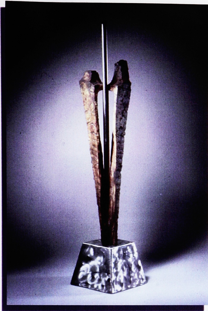
Chisel\Spike Clay and Stainless Steel 48"x9"x9"