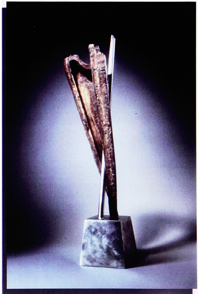
Chisel\Spike II Clay and Stainless Steel 45"x8"x8"