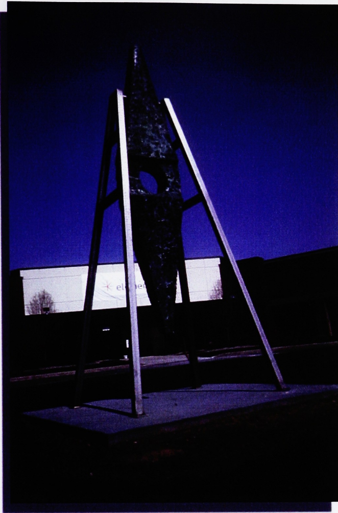
ADZ\PICK Fiberglass and Stainless Steel 20'x8'x8'