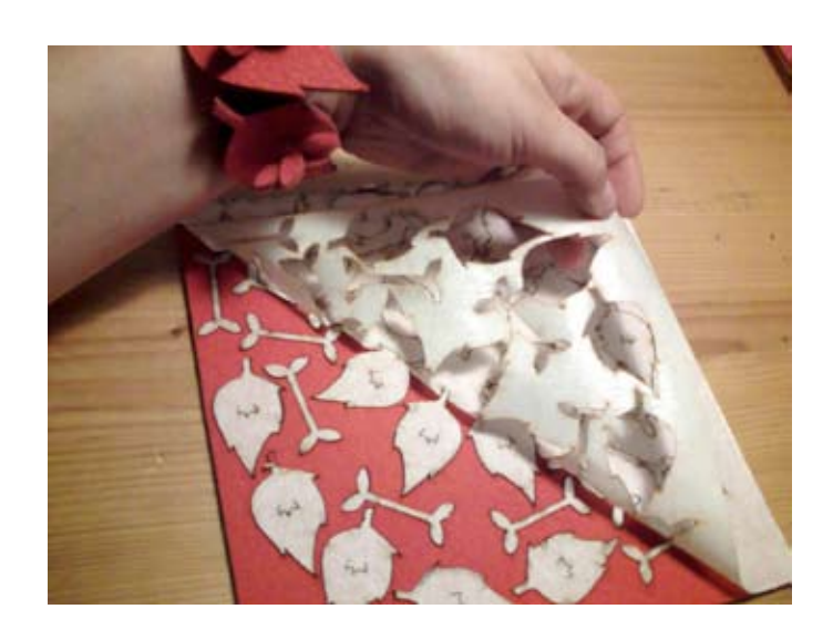
Laser cut prototype of the students' design manufactured by Ponoko.com