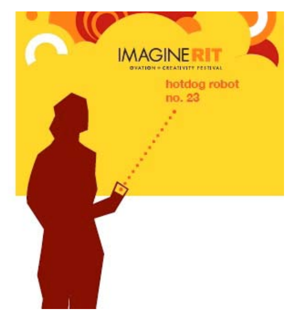
Early concept sketch of the TAGG Imagine RIT project.

"rules" for these product demonstrations. On the student-team side, we encouraged them to use language that could be understood across disciplines when presenting their work in the Innovation Sessions. If and when the teams used terminology that we, the instructors, felt might not be understood by all in attendance, we would light-heartedly interject with a question such as, "What's a GUI?"