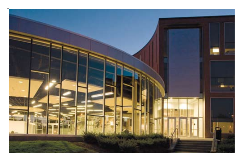
RIT's Center for Student Innovation.

One of RIT's initiatives to overcome these difficulties has been the construction of a new Center for Student Innovation, as a place where students from traditionally right-brained (fine arts, humanities, and design) and left-brained (science, computing, and engineering) disciplines can work together. This structure is a ten-thousand square foot circular glass building that stands in marked contrast to the 1960s brutalist architecture dominating the rest of the campus. The research from the students who participated in the Collaborative Innovation Program last year had a positive impact on what we find in the Innovation Center at present: flexible furniture, immersive computing capabilities, rolling white boards, and a "hacker" space filled with tools and materials.