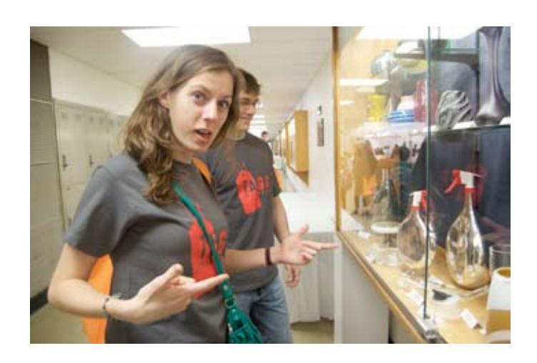
Members of the TAGG Imagine RIT on festival day scouting out exhibits

Student-led workshops turned out to be a smashing success. The only criteria for the students workshop theme was that they choose something that they knew how to teach that they felt had cross-disciplinary appeal. When the time came for the workshops, we, the instructors, watched in awe as our students led the session attendees though workshops of their own design such as "How to write a Business Plan" or "Take Great Product Shots." It became clear to us that peer-to-peer knowledge sharing across academic disciplines is an untapped resource at RIT.