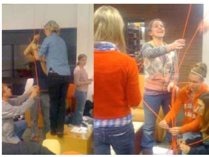
Innovation Session Activity: Build a Tall Tower with Straws

as a way to engage students, staff, and faculty who were interested in the program but unable to sign up for the courses.