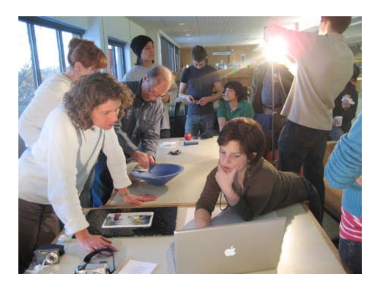
Innovation Session: Student-led workshop entitled "Take Great Product Shots"