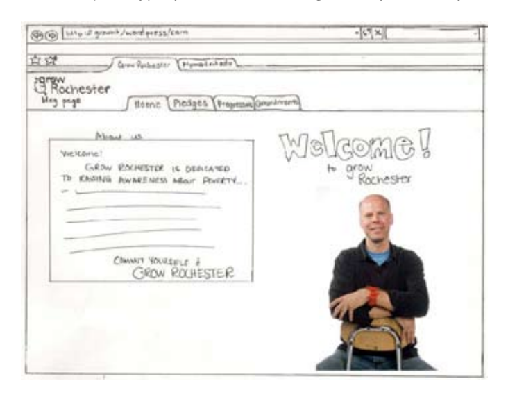
Photo of model wearing the GROW prototype incorporated into a wire-frame of an online market for the product.