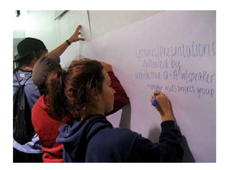
Innovation Session Activity: Draw on the Walls