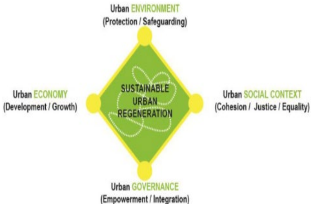
Figure 2 Main pillars in urban development