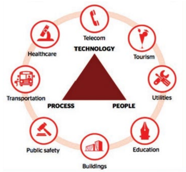
Figure 4 key pillars of a smart city

The DSO urban plan will be designed to allow its sanitation, drainage system, and housing to be conducive for human beings so that the quality of life they lead is not compromised. Proper sanitation and drainage will prevent water-related vector-borne infections, fecal-transmitted infections, and chronic conditions due to exposure to agrochemical residues (Kent et al., 2018). Malaria and schistosomiasis are common in areas with poor drainage since the vectors live in aquatic environments. A respondent noted that although the DSO plan provides proper drainage and sanitation systems, proper maintenance of drainage structures will ensure that people are not exposed to environmental health problems. Smart waste management system aims to promote proper sanitation and prevent health hazards associated with poor sanitation. The management system includes sensors that are installed in garbage bins and are operated through IOT technology.