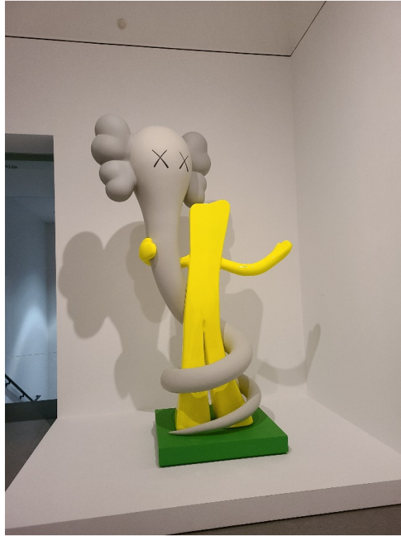
Figure 31: Three- dimensional figure reminiscent of Keith Haring collaboration