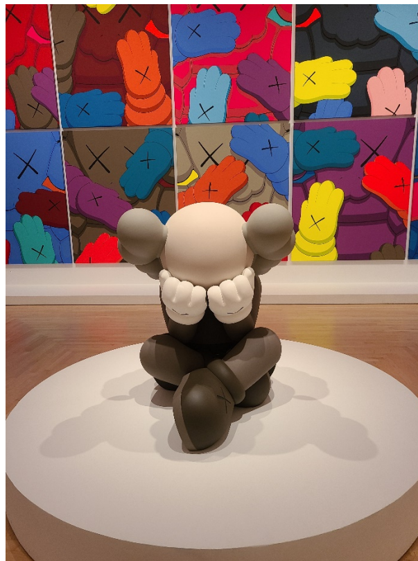
Figure 34: Companion in center of gallery space