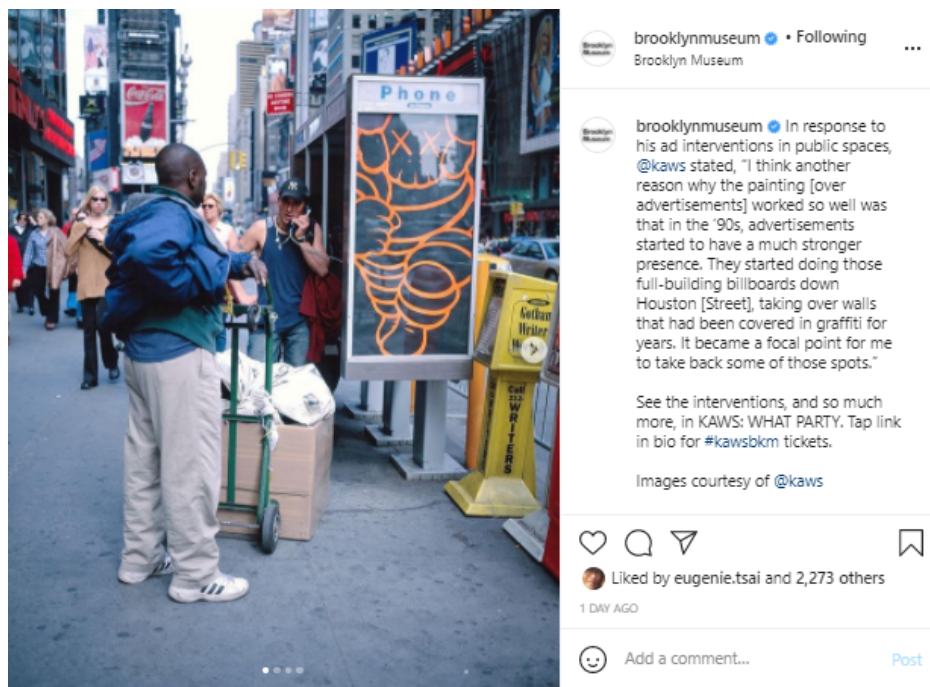
Figure 12: Brooklyn Museum Instagram post highlighting KAWS' background as a street artist, with a quote by the artist