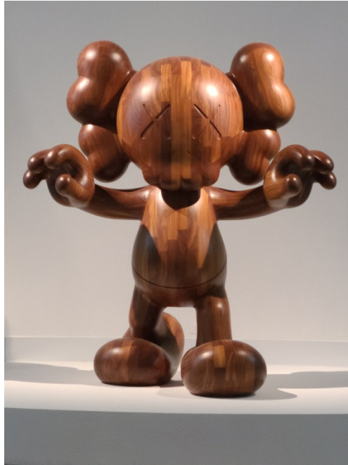
Figure 39: Wooden Companion , arms raised