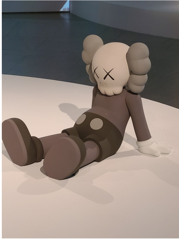
Figure 41: Companion , sitting up on platform