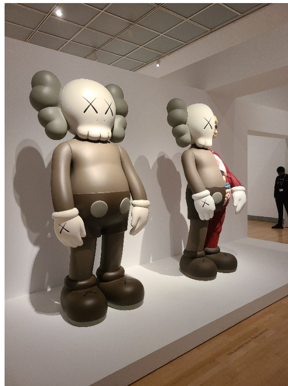
Figure 8: Varying versions of KAWS' Companion