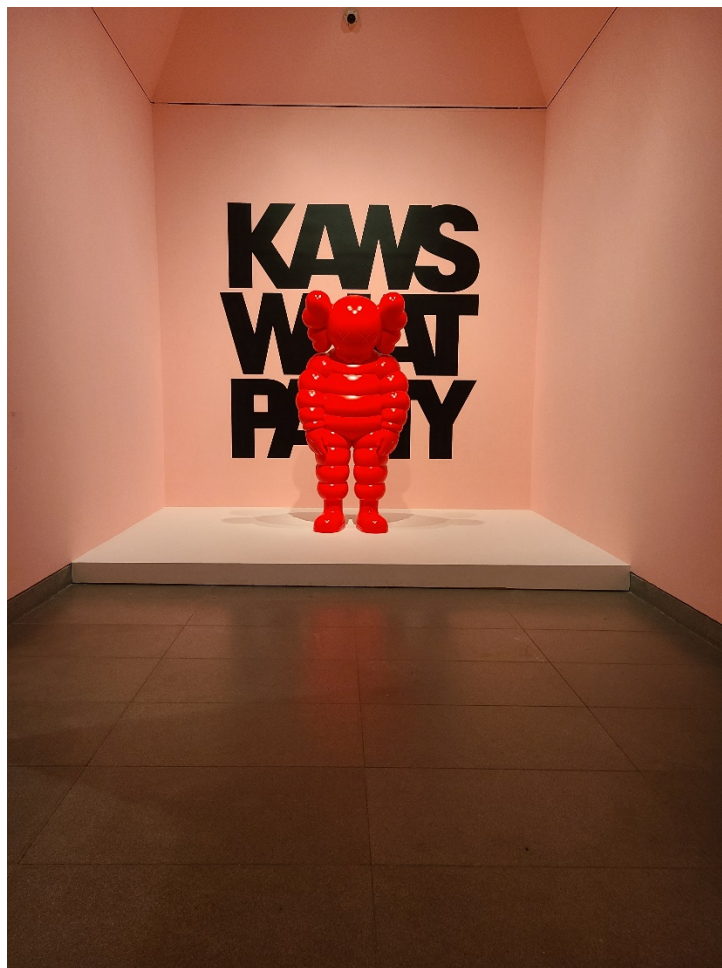
Figure 16: Pink entrance room to the KAWS: WHAT PARTY exhibit