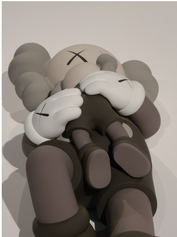
Figure 40: Companion holding smaller iteration on platform