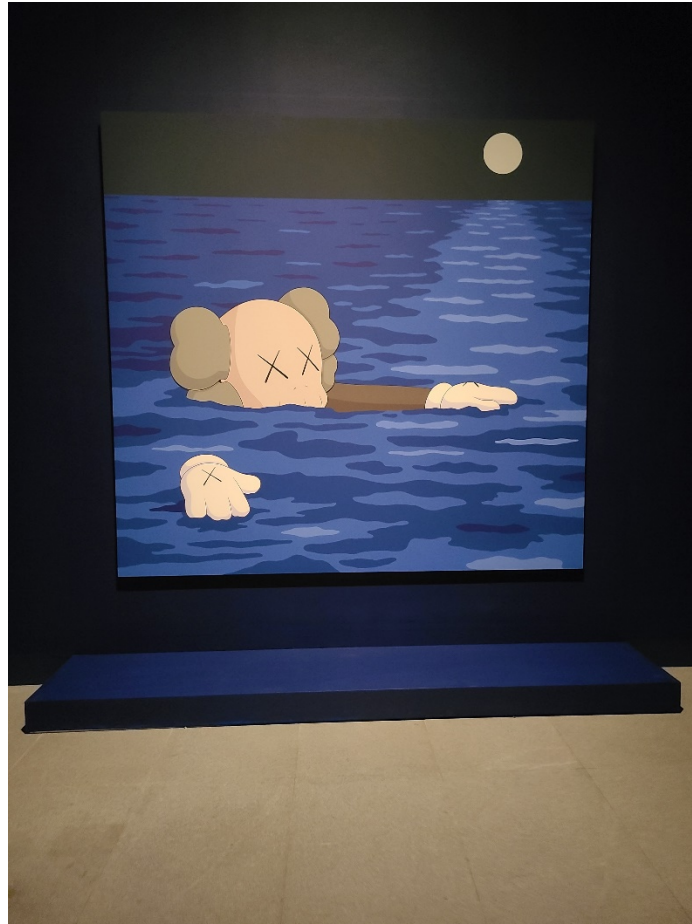
Figure 35: KAWS painting, Tide