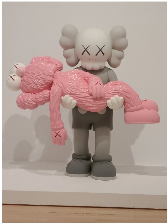
Figure 24: Large-scale Companion- Gone