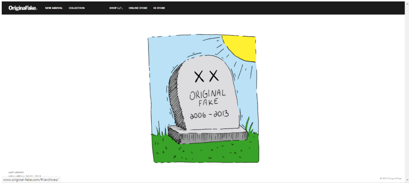
Figure 9: Current homepage of KAWS' original website, OriginalFake