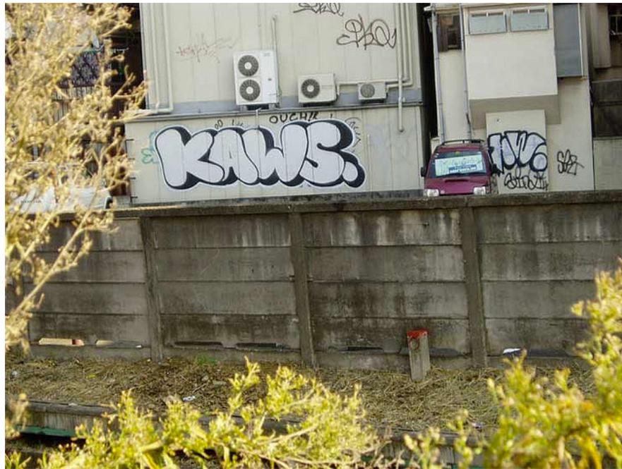
Figure 1: Untitled , KAWS, 1994