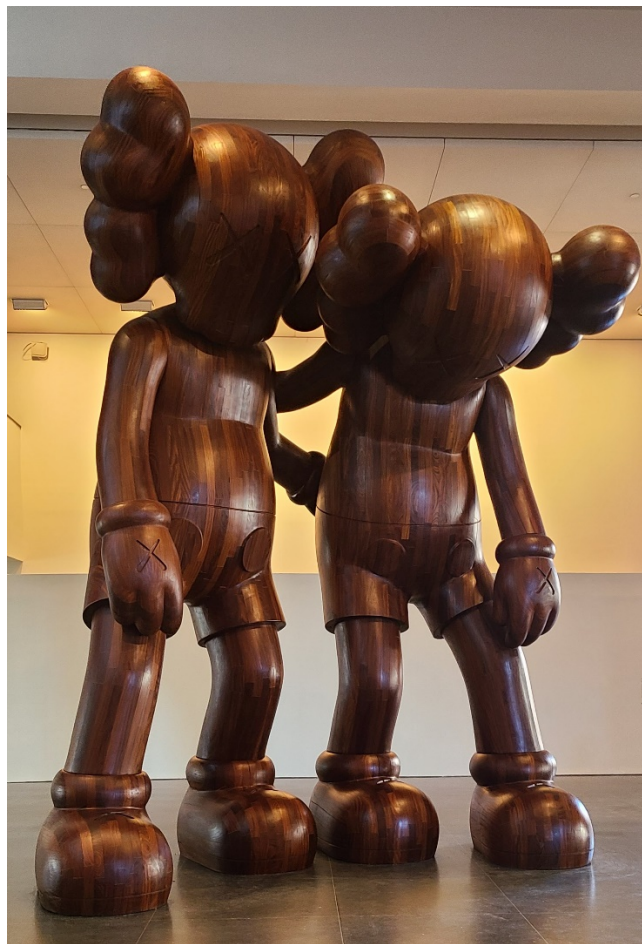
Figure 14: Wooden Companion figure in the Brooklyn Museum lobby