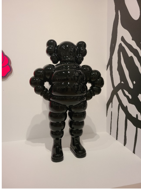
Figure 25: Large-scale WHAT PARTY figures