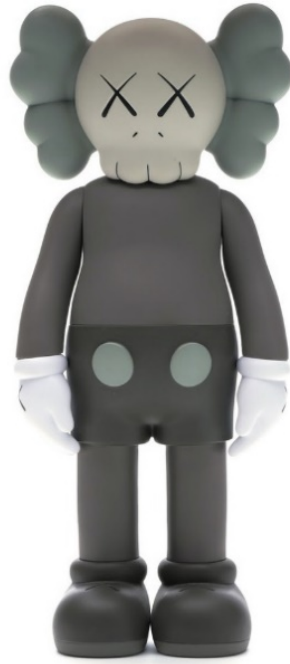
Figure 3: Companion , KAWS, 1999