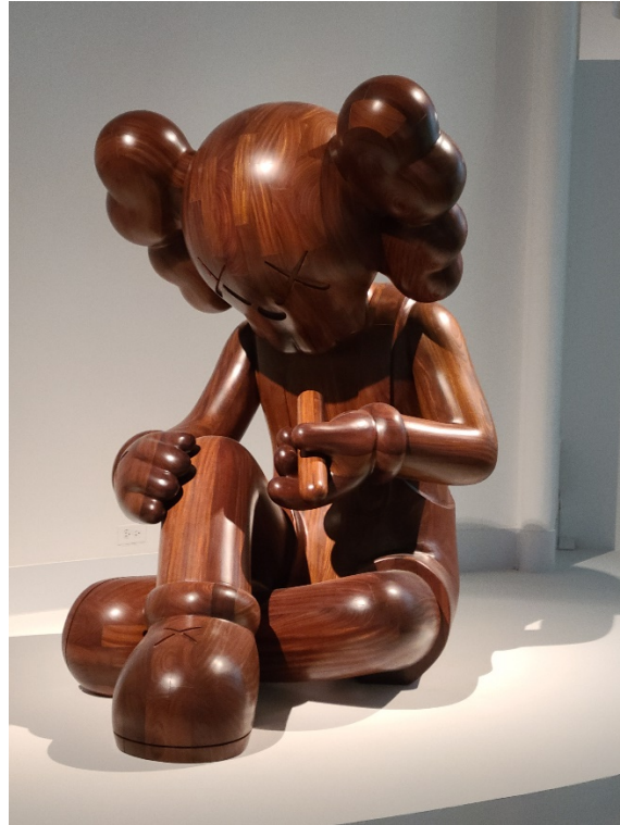
Figure 37: Wooden Companion , seated