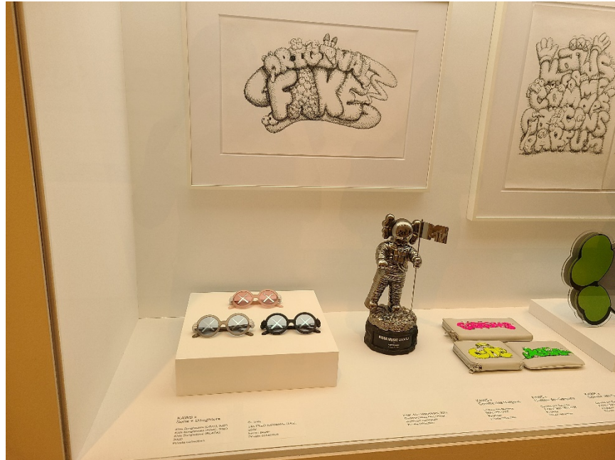
Figure 27: Example of KAWS collaborations- MTV Video Music Award, KAWS x SD eyewear