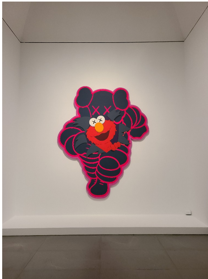
Figure 30: Elmo bursting out of Companion