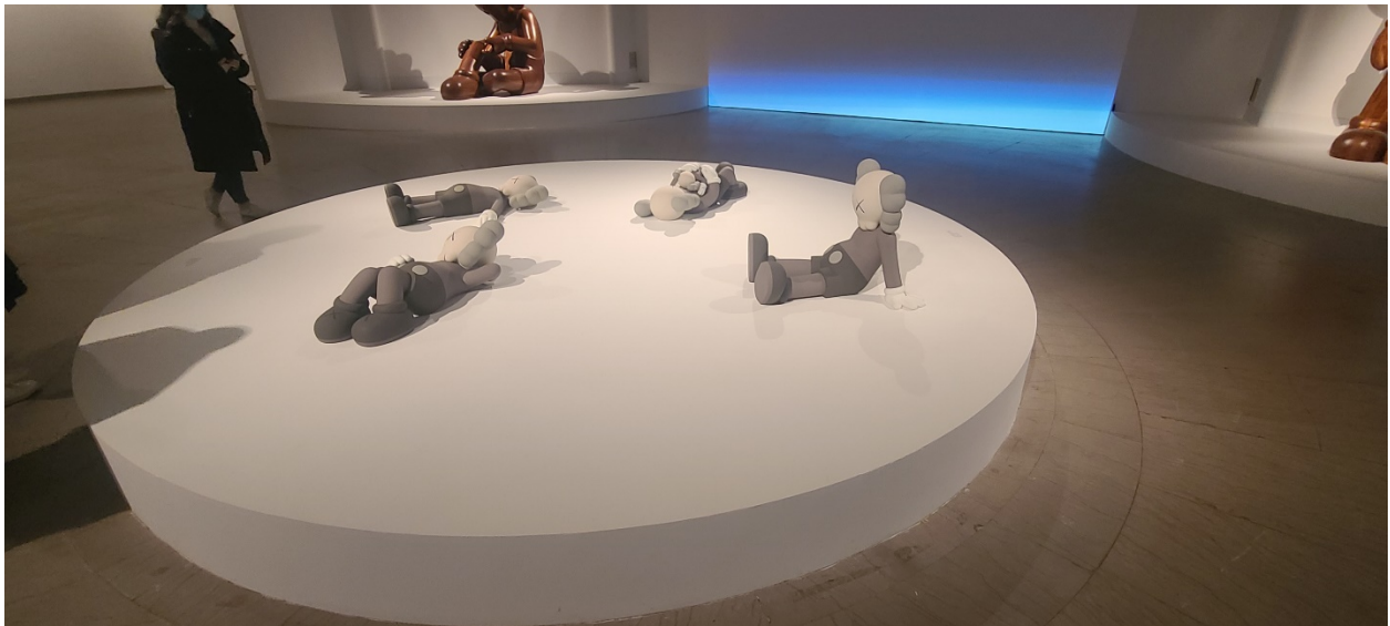
Figure 42: Smaller Companion figures on round platform, surrounded by wooden iterations