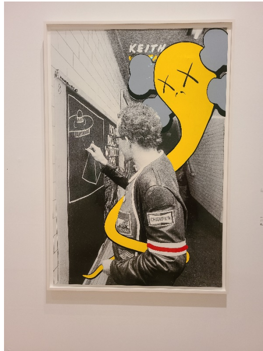
Figure 17: KAWS' "forceful collaboration" with Keith Haring work