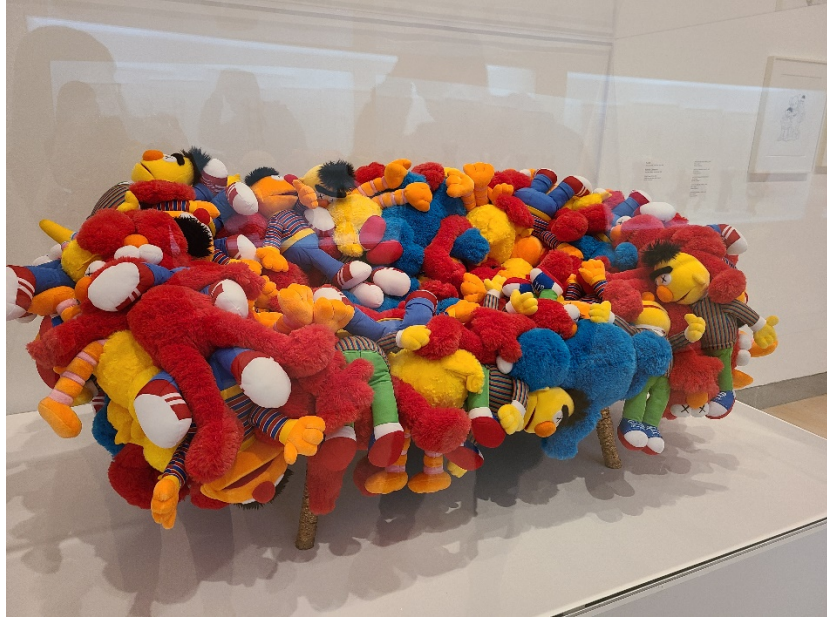
Figure 29: KAWS stuffed animal couch