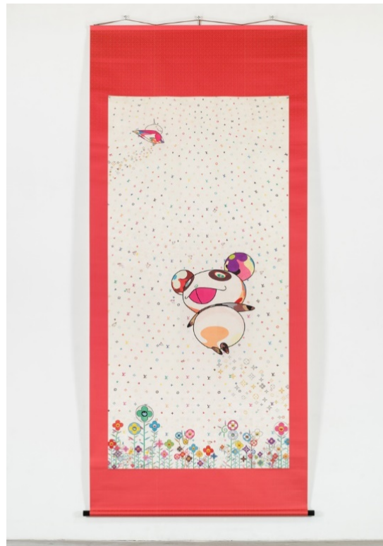
Figure 4: The World of the Sphere , Takashi Murakami, 2003