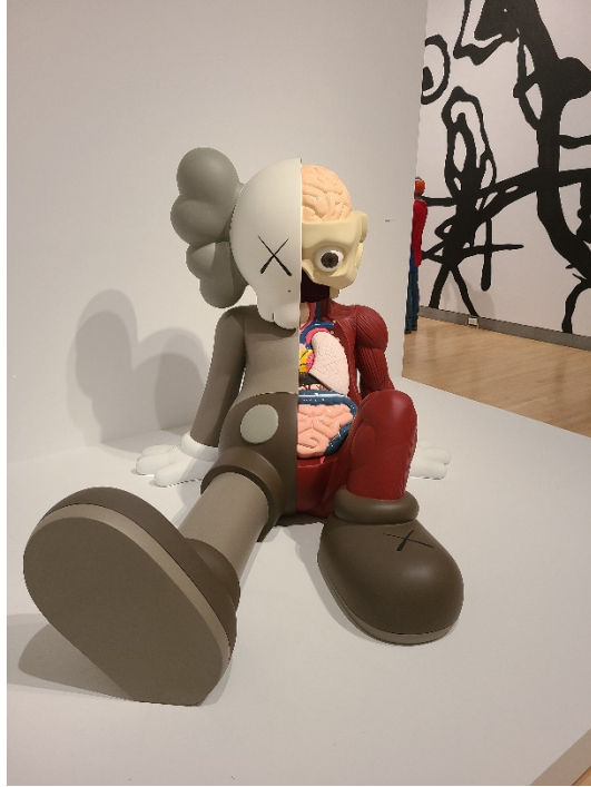
Figure 23: Large- scale Companion- Flayed