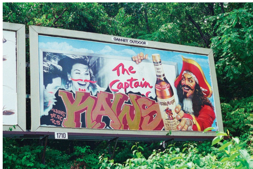
Figure 2: Captain Morgan , KAWS, 1995