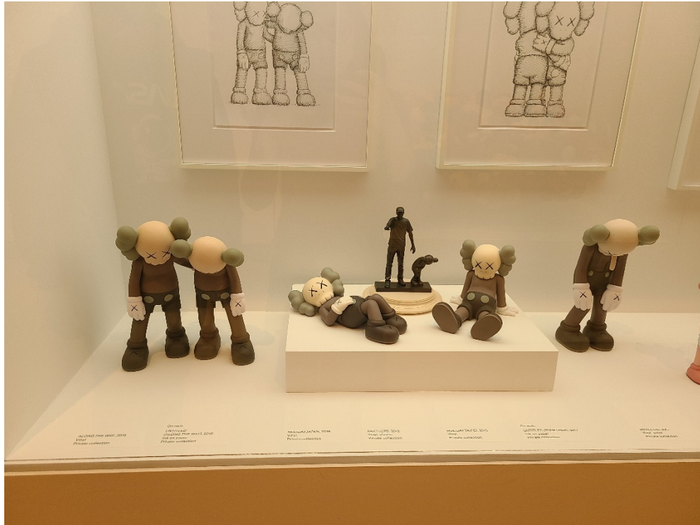
Figure 19: KAWS' sketches behind completed three-dimensional works