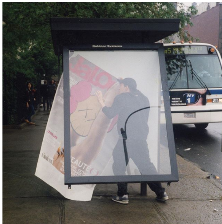
Figure 6: KAWS Re-Installing a Stolen Advertisement from Paris in NYC, 1999