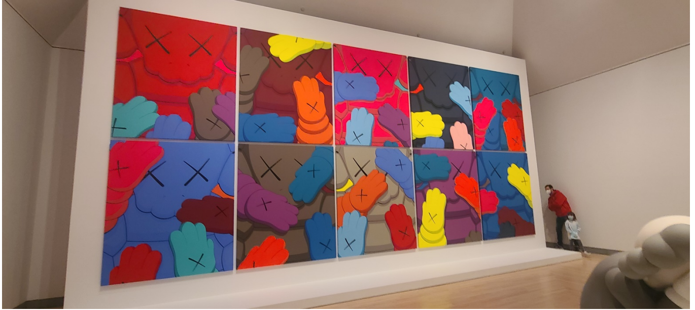
Figure 33: Tile wall installation depicting Companion features