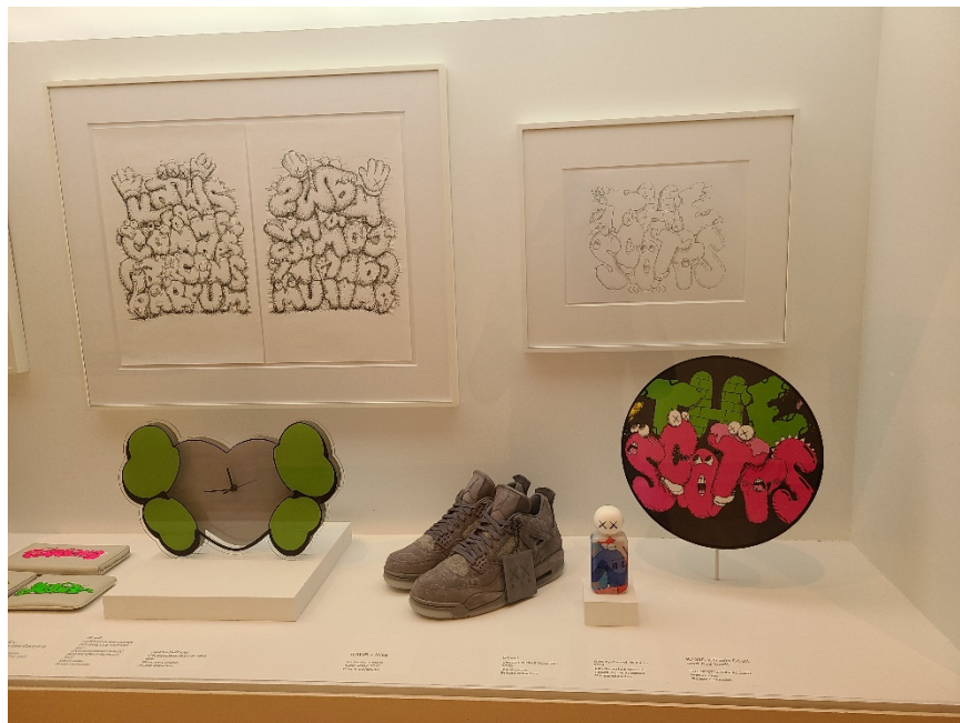
Figure 26: Example of KAWS collaborations- Comme des Garçons, Travis Scott