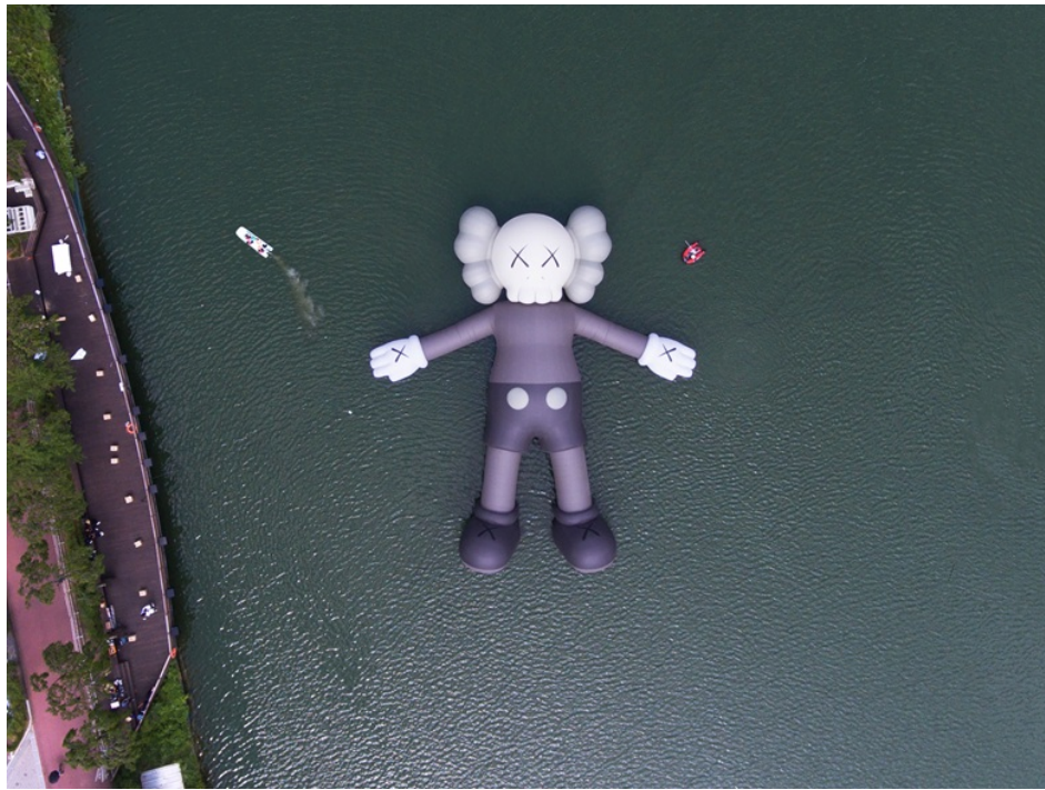
Figure 5: KAWS: Holiday , KAWS, 2019