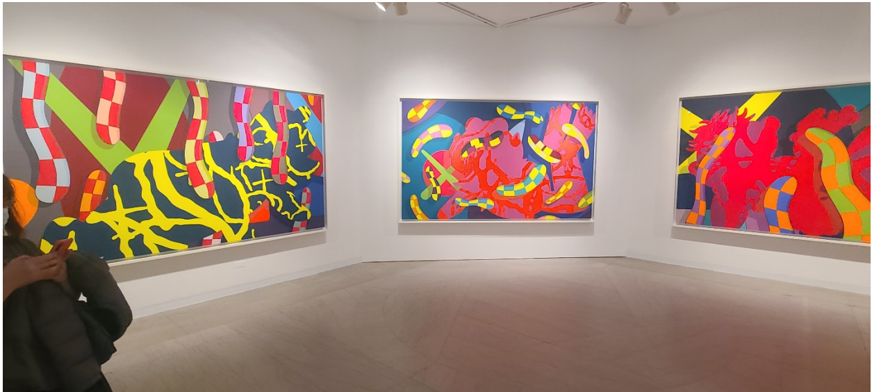
Figure 36: Exhibit gallery of abstract paintings