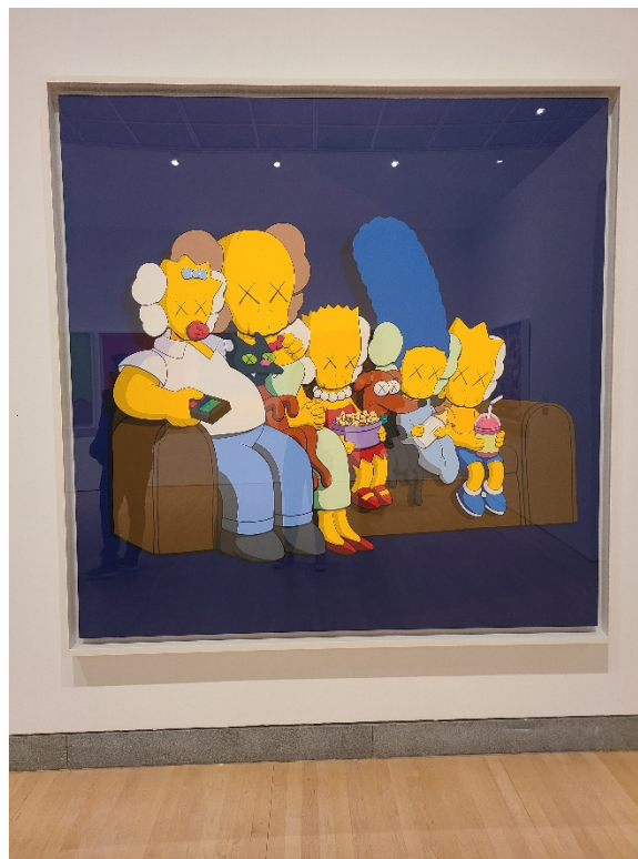
Figure 18: One version of KAWS' Kimpsons