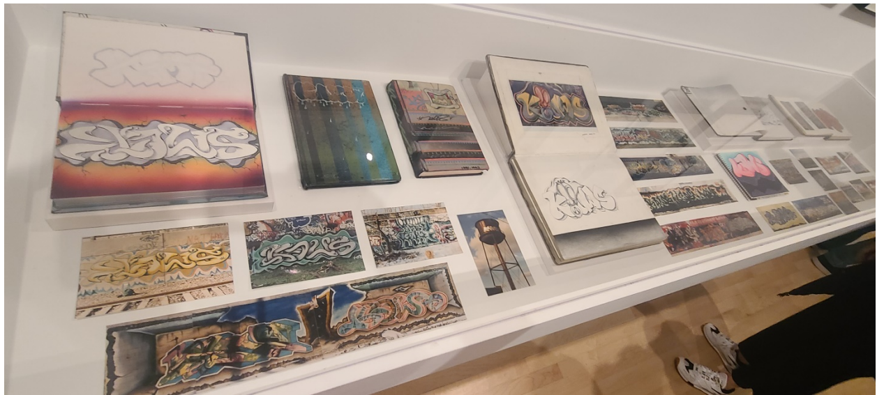
Figure 20: Collection of early KAWS sketches and accompanying sketchbooks