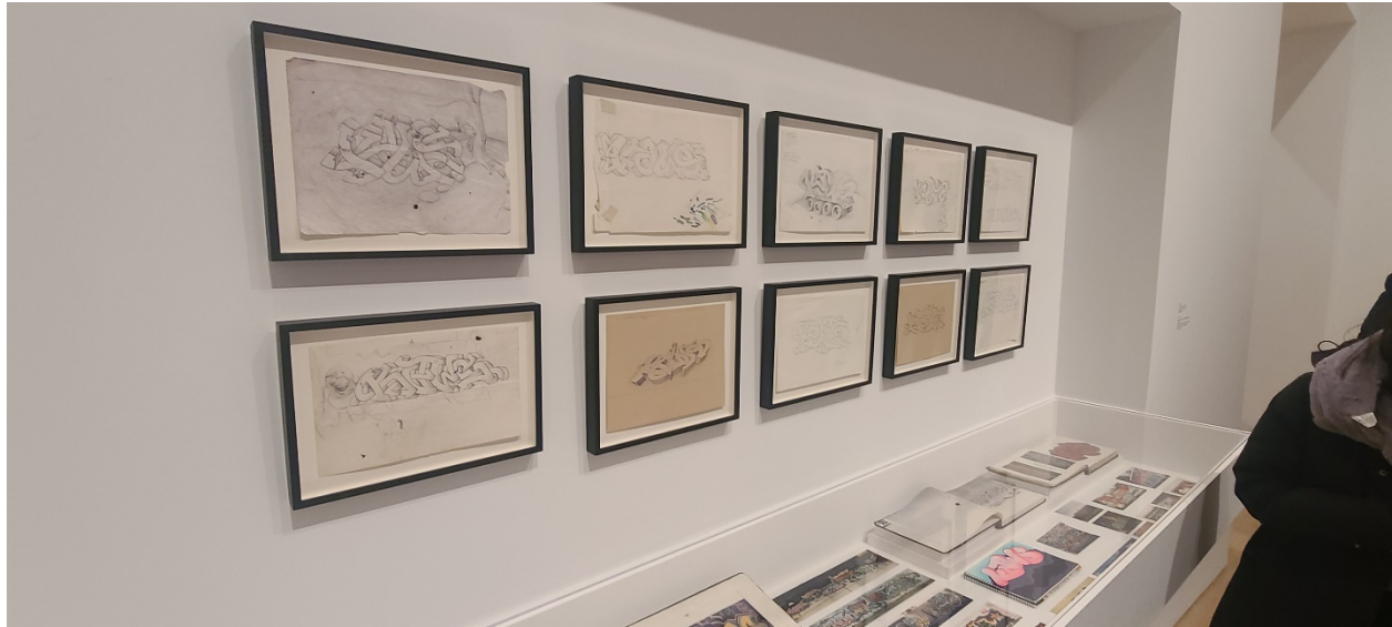
Figure 15: Original sketches by KAWS from the 1990's