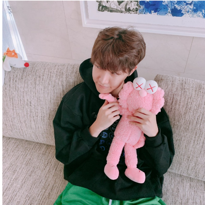
Figure 7: BTS member J-Hope holding a KAWS figure