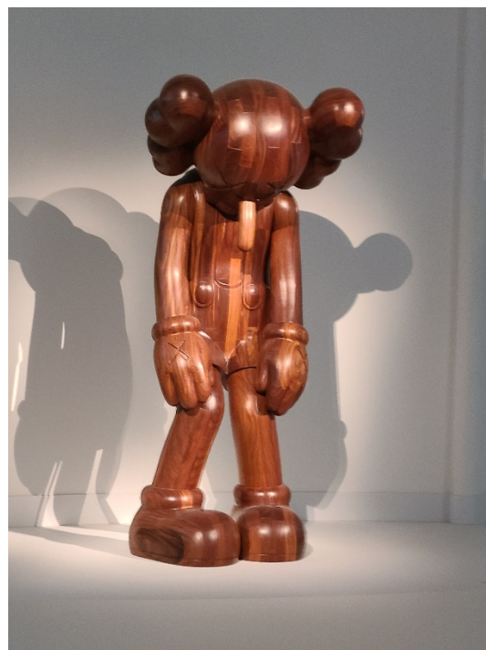
Figure 38: Wooden Companion , slouching