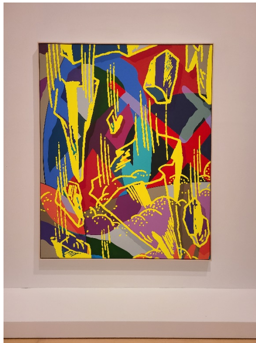
Figure 32: KAWS abstract painting