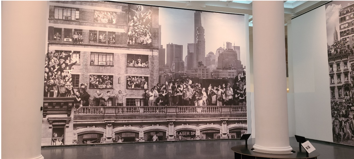
Figure 13: JR's Chronicles of New York City at the Brooklyn Museum