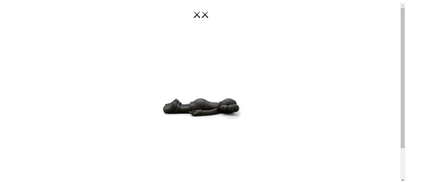
Figure 10: Current homepage of KAWS' website, KAWS ONE