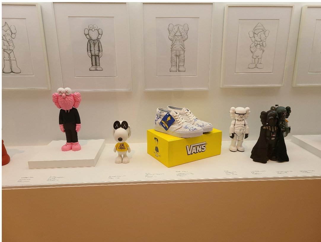
Figure 28: Examples of KAWS collaborations- Van's sneakers, Star War figures