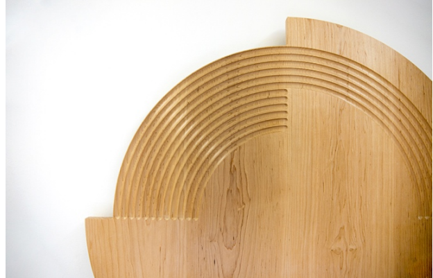
Wall Pieces Material: Maple Dimensions: 28.5" W x 28.5" D x 1.15" H