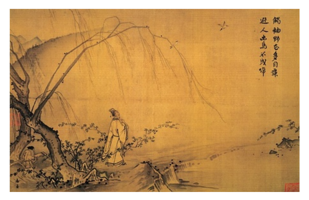
(Walking on a Mountain Path in Spring)

Walking on a Mountain Path in Spring depicts the protagonist who contemplates over the two birds on the wind-blown weeping willow, surrounded by the vibrant peach blossoms. He is twirling his beard and smiling, basking in the early spring's vibrancy. Couplet calligraphy placed in the upper right corner of the painting, which says 'Brushed by his sleeves, wildflowers dance in the wind; fleeing from him, the hidden Birds cut short their songs.' In the background of the picture is a vast and limitless landscape. The large blank areas allow me to focus on his performance of detail. The density of this arrangement, the big and small of the characters, all contribute to the rhythm.