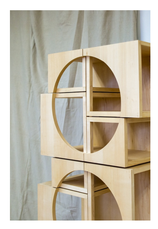
Shelves Material: plywood and maple veneer Dimensions: 27" W x 12.5" D x 70" H