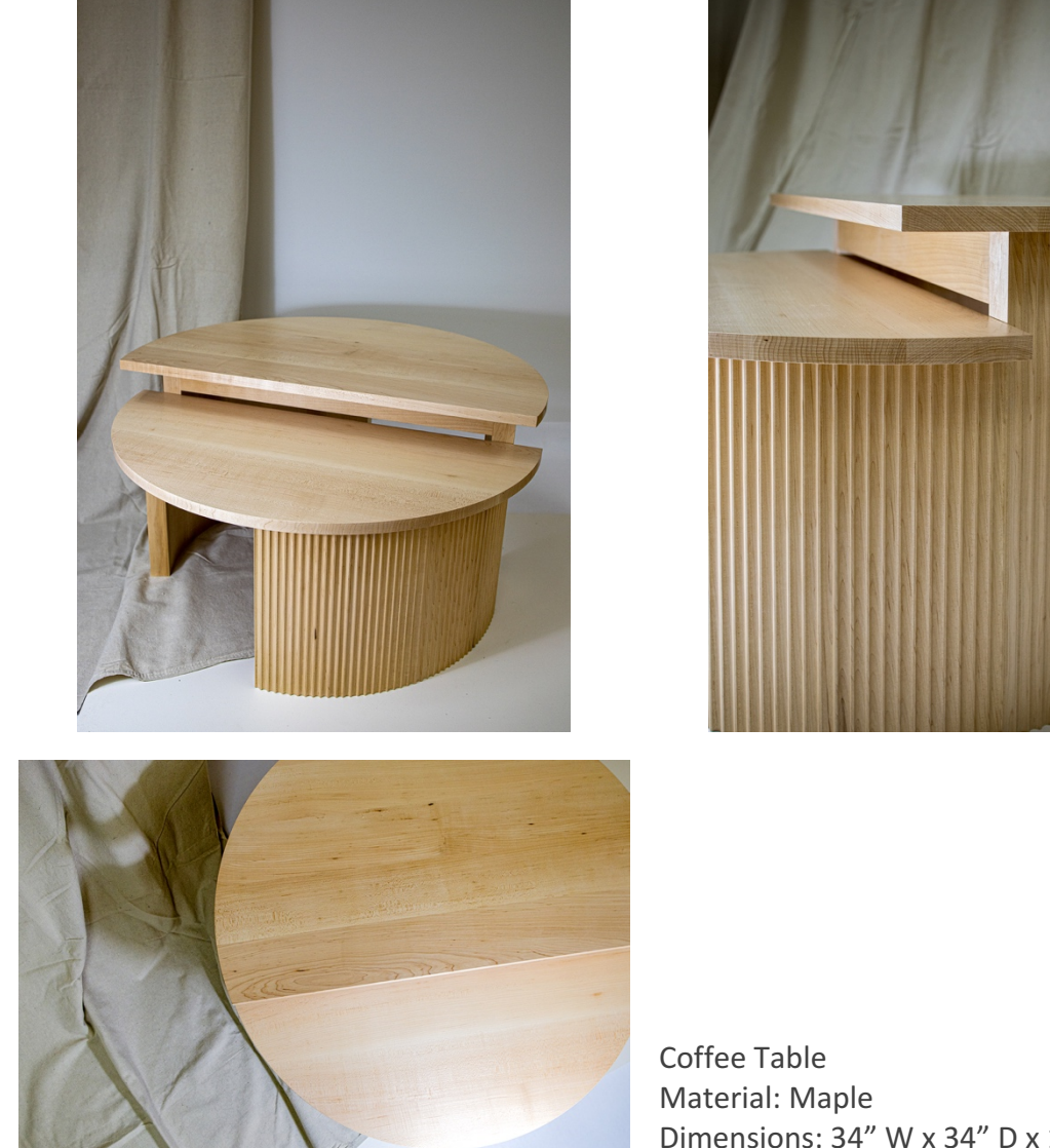
Dimensions: 34" W x 34" D x 18" H