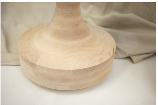
Stools Material: Maple Dimensions: 14" W x 14" D x 17" H