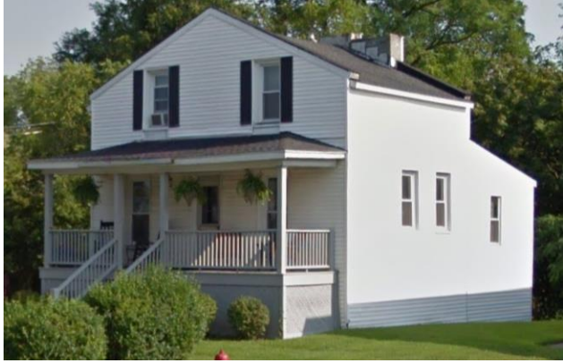
Figure 4. Latham House at 37 West Bayard Street.