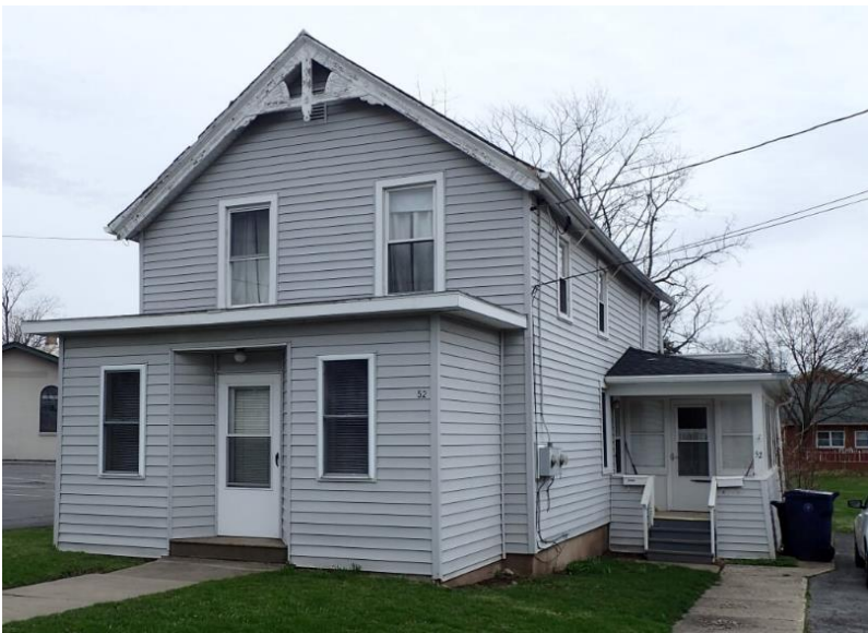
Figure 9. James House. Photograph by author, 2019.