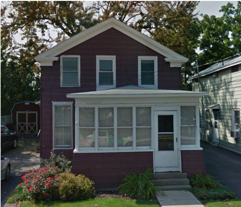
Figure 11. Wesleyan Parsonage.