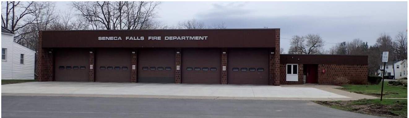
Figure 5. Historic site of Latham House at 39 West Bayard Street. House removed to construct village fire house. Photograph by author, 2019.