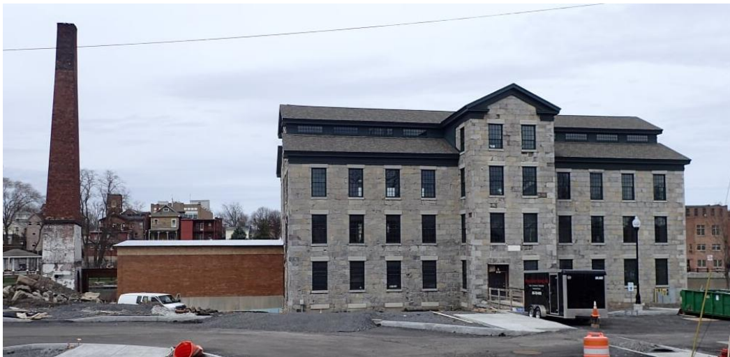
Figure 3. Seneca Knitting Mill.