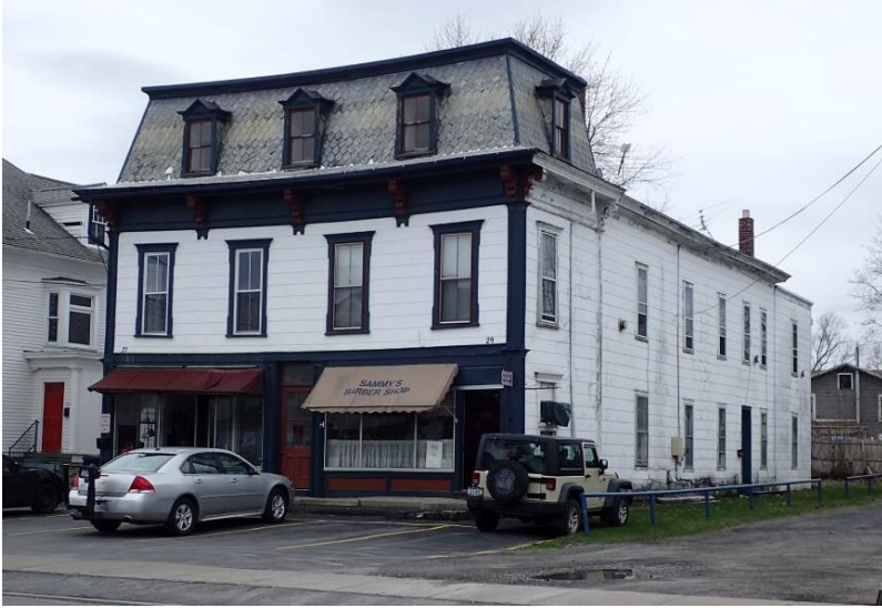
Figure 8. Historic Presbyterian Church.