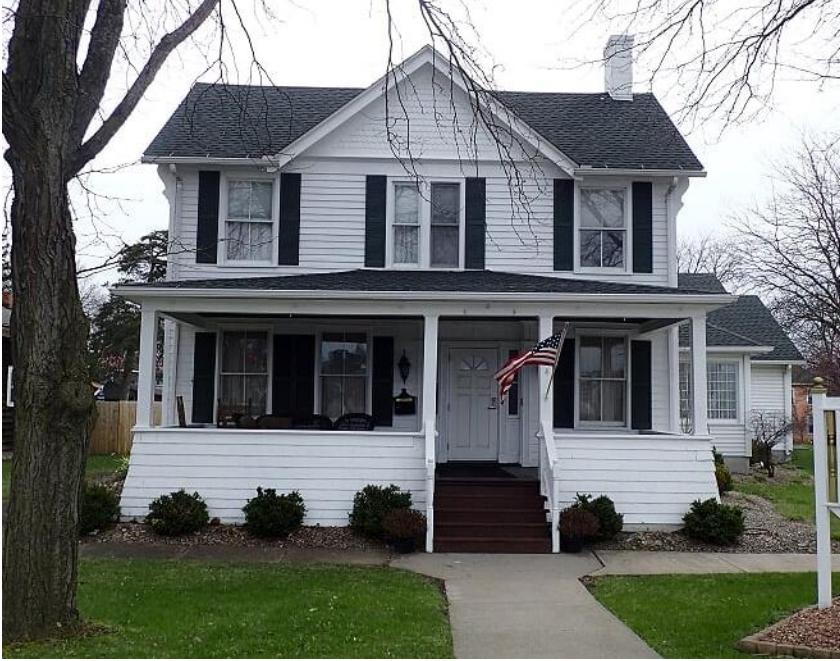
Figure 6. Bascom House.