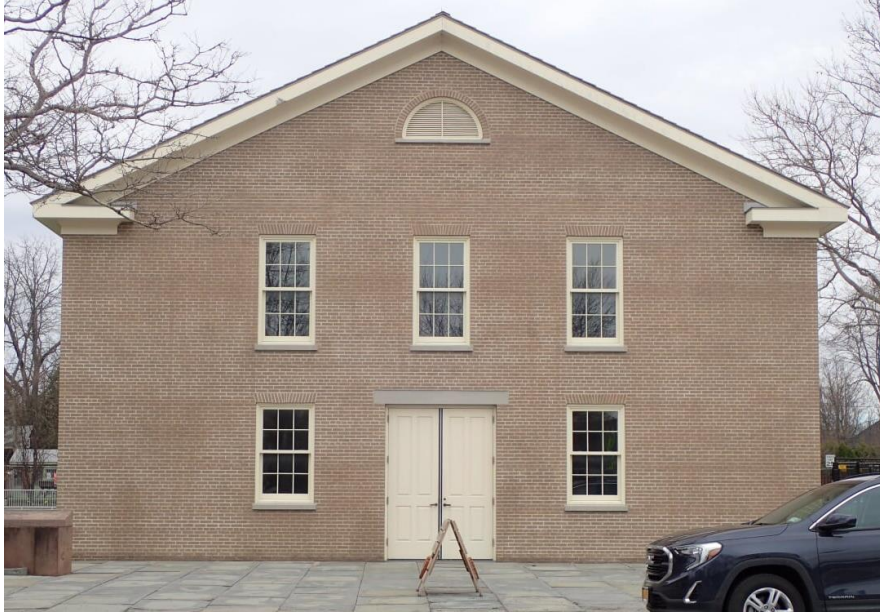
Figure 12. Wesleyan Chapel, front view.