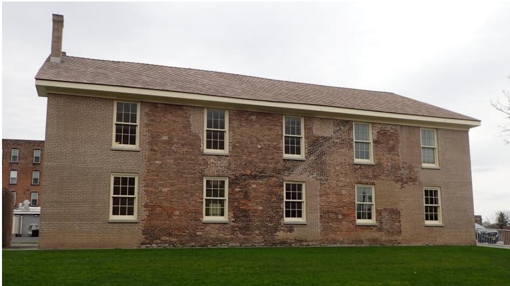
Figure 13. Wesleyan Chapel, side view. Photograph by author, 2019.