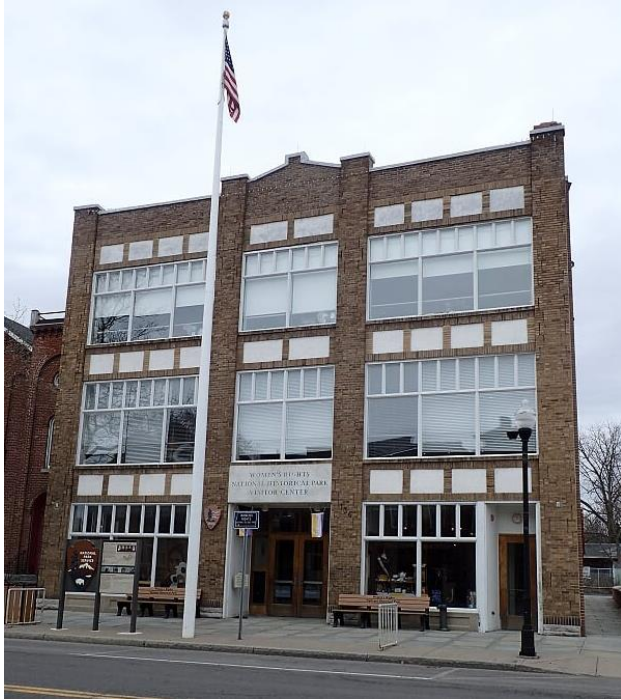
Figure 2. Women's Rights National Historical Park Visitor Center.