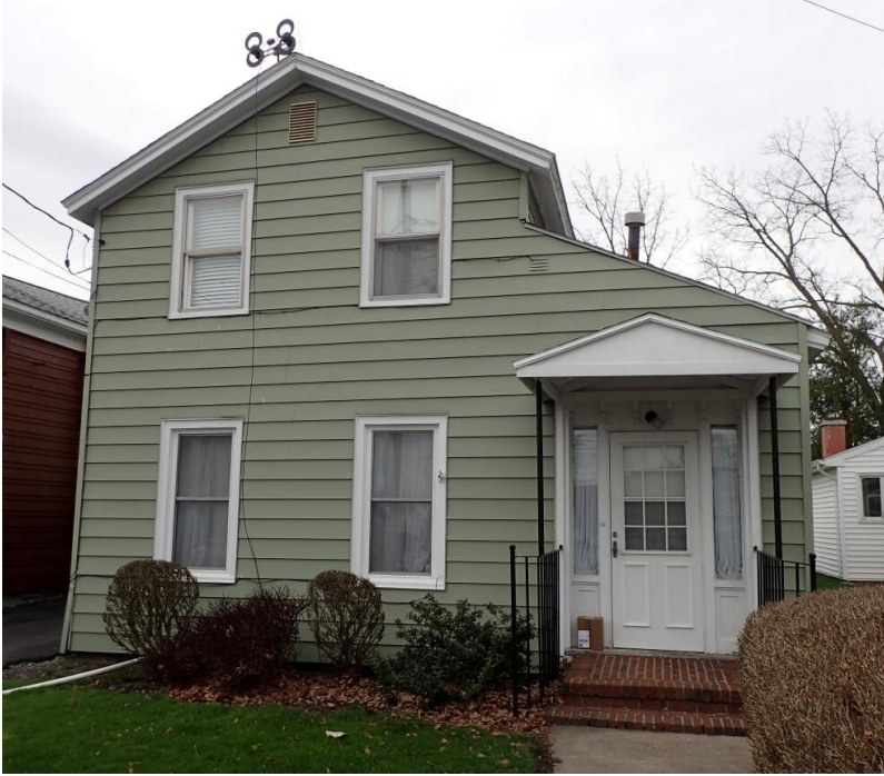
Figure 10. Bellows House. Photograph by author, 2019.