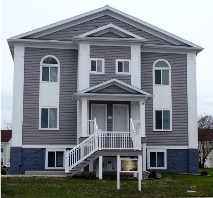
Figure 7. Historic Trinity Episcopal Church.