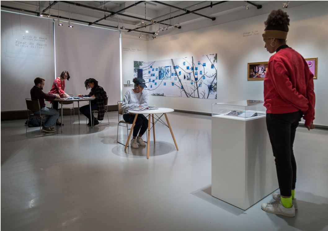
Flesh So Peach , Installation View