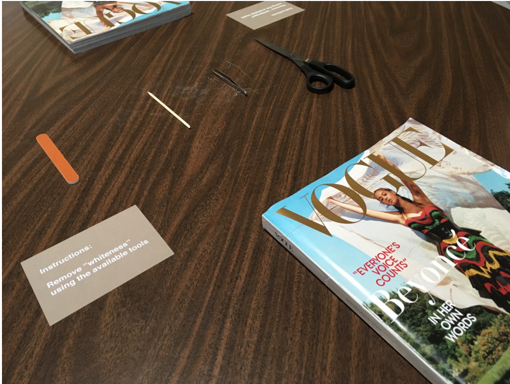
"Work Table", Detail View