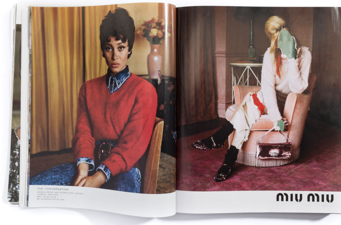
Spread of cutouts