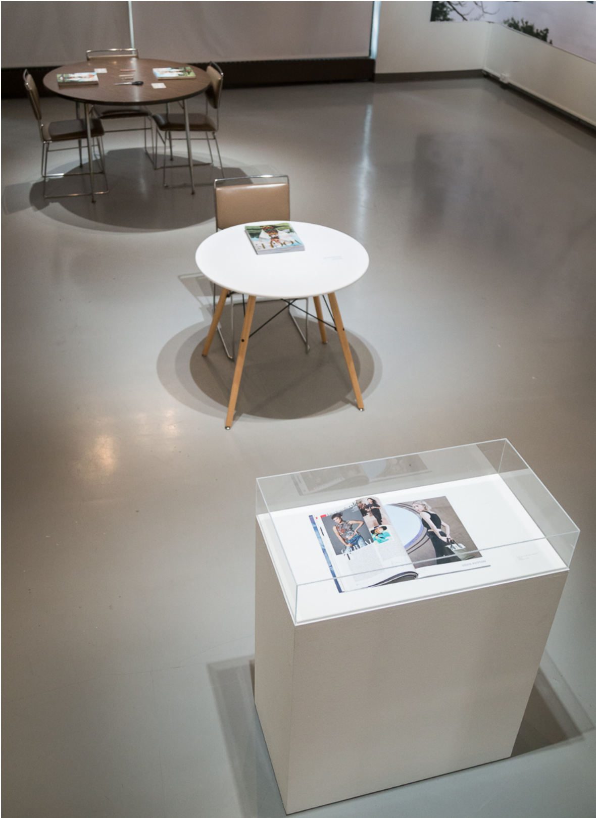
Flesh So Peach , Installation View, 2019