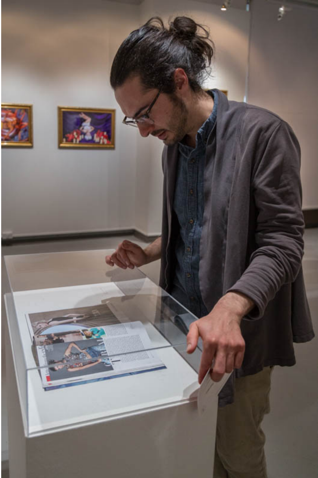
Flesh So Peach, Installation View