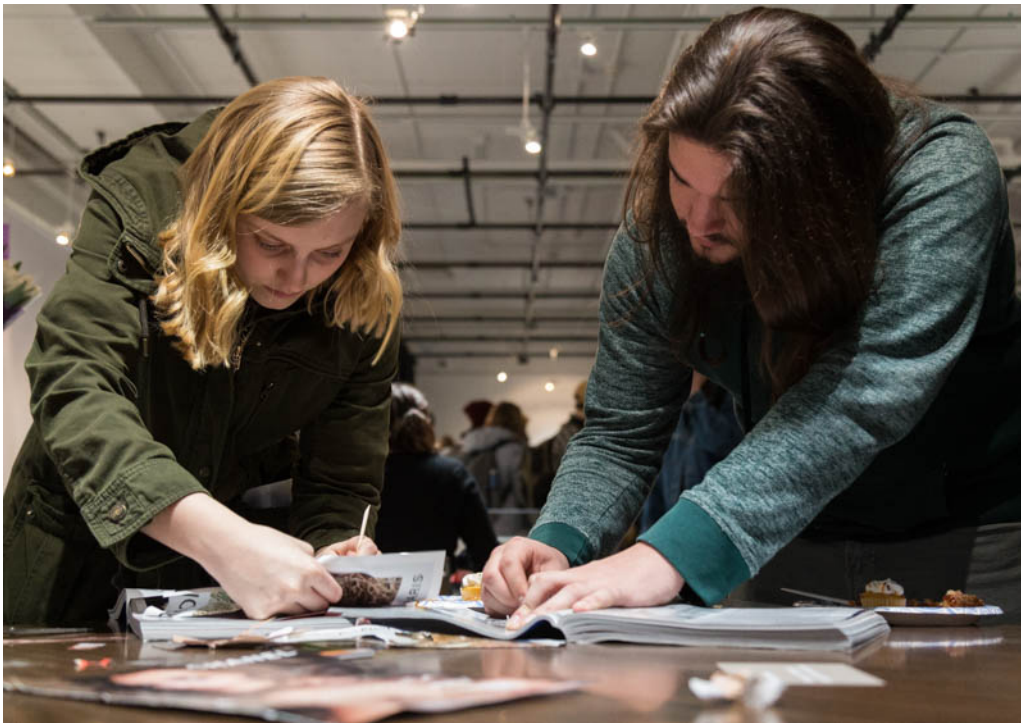
Audience participation at the "Work Table"