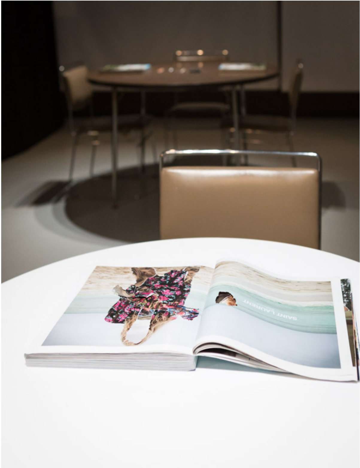
Flesh So Peach, Installation View