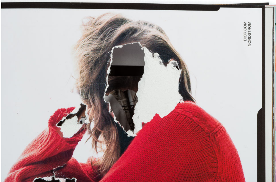
Detail of cutouts