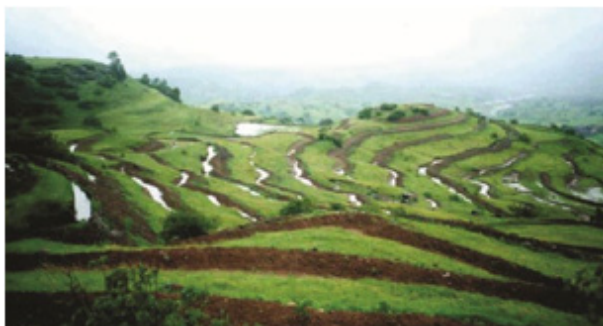
Figure 2: Continuous Contour Trenches (CCT)

Watershed management facilitated higher water availability. As access to water became easy, farmers switched from traditional to modern methods of farming. These employ new and scientific methods of farming which are quick, efficient, and easy to undertake, resulting in capital gain and crop consistency. Villages which could not successfully grow one crop in the past, started growing up to 3 crops a year with the help of sufficient water. On average, families earned up to ₹70,000 a month, with some earning even up to ₹2,00,000 a month. Neither do all farmers have equal areas of land to cultivate, nor are all the lands equally fertile. Small landowner/farmers ventured into the dairy business. Along with low maintenance costs, the dairy business also provides additional income. This business supplies farmers with dung compost which helps