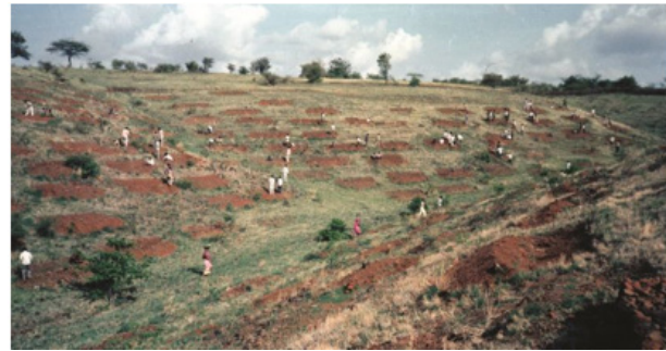
Figure 1: Villagers performing Shramdaan to build CCT

It has been observed that people care very little for things that are given to them for free and this leads to exploitation of the given resource. For any project, workers sent by the government usually work with the aim of completing the work quickly with no regard to quality of work.