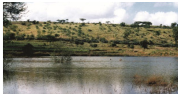
Figure 3: Farm Pond located in Ralegan-Siddhi