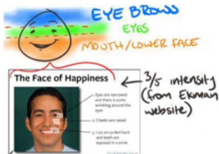
Fig. 2. Reference image from Paul Ekman's work and 2D illustration design direction