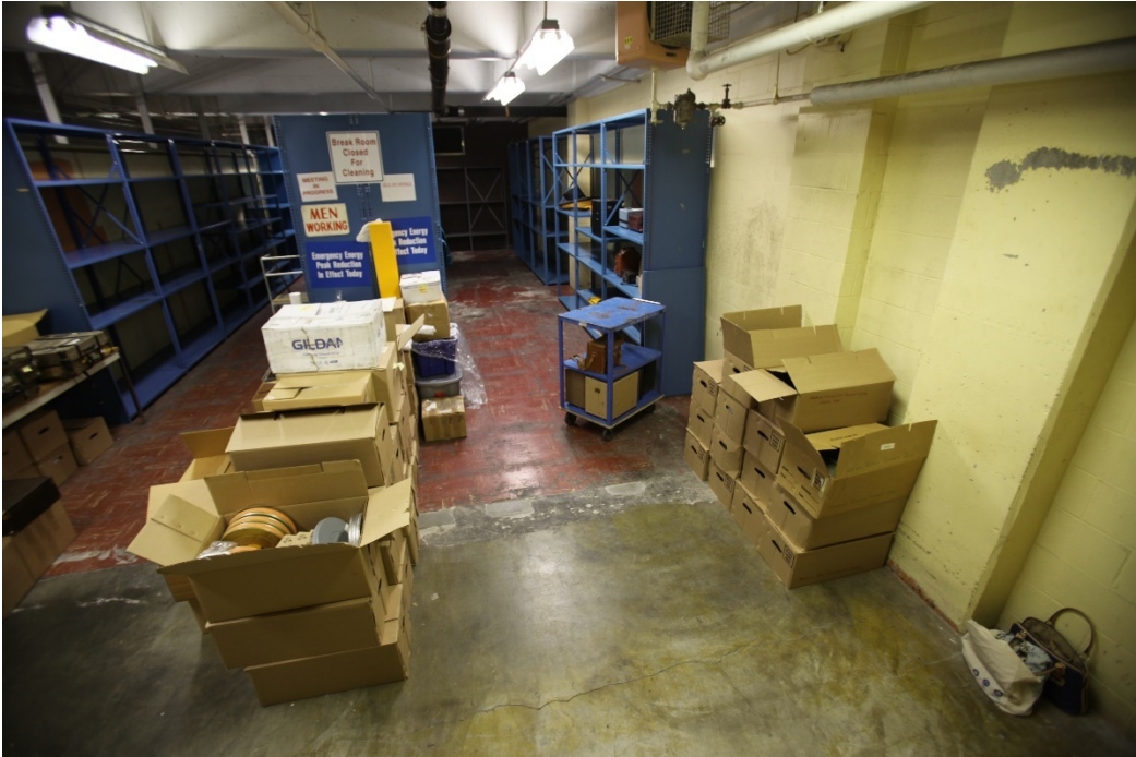
Fig. 4: The archive on the first day of the project, with all the objects still in their original boxes. Photograph by Alexandra Serpikov, January 2017.