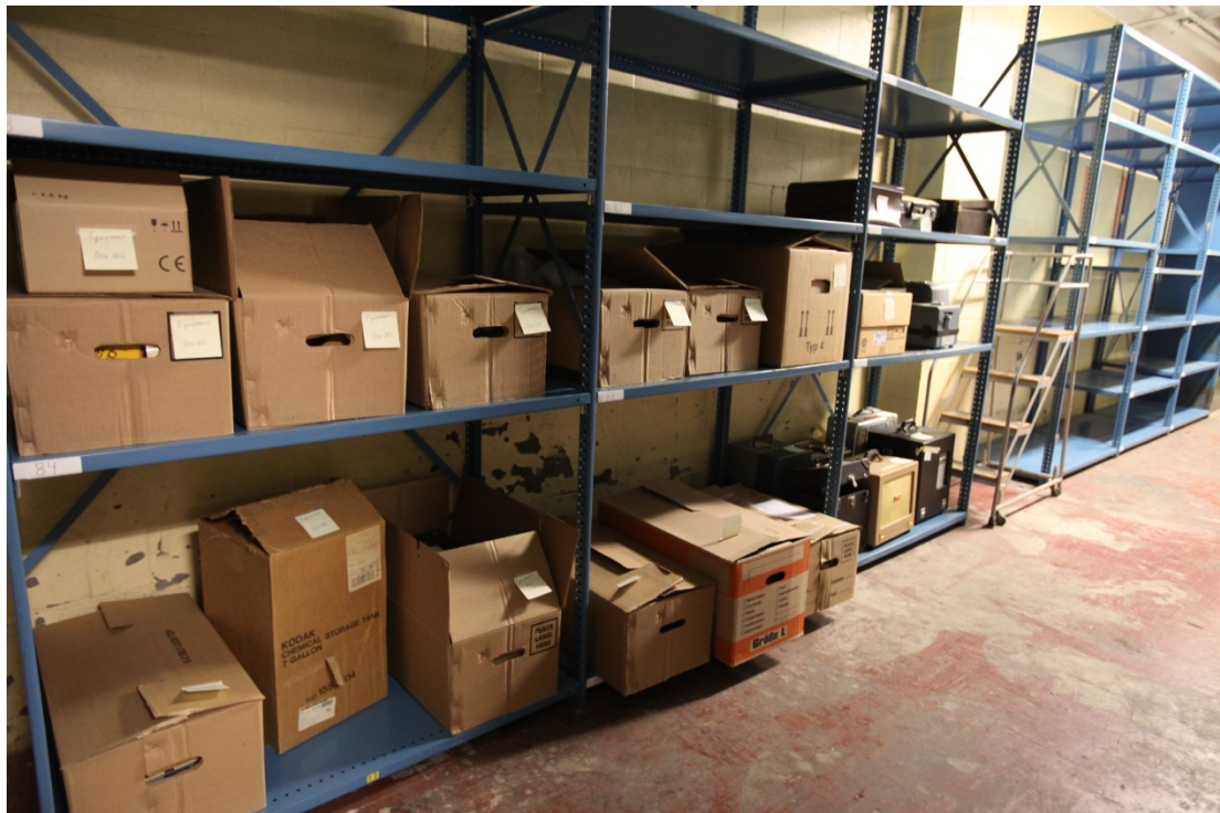
Fig. 6: The equipment collection, stored in original boxes. Photograph by Alexandra Serpikov, January 2017.