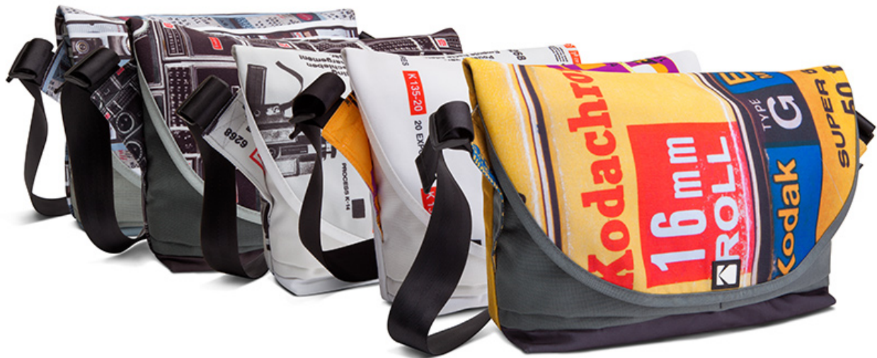
Fig. 10: Kodak Messenger Bags, from the KODAK Collection.

Retrieved from https://www.kodak.com/us/es/Consumer/Products/Collection/cooler/default.htm , April 2, 2018.