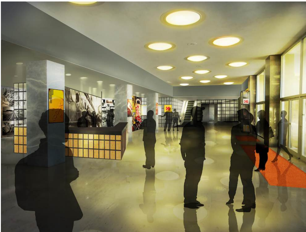
Fig. 1: Mock-up design of the lobby of Building 28 at Eastman Business Park, which will become the Kodak Experience Center. Designed by Jack Rouse Associates (JRA). Retrieved from http://www.inparkmagazine.com/jra-kodak/ , February 16, 2018.