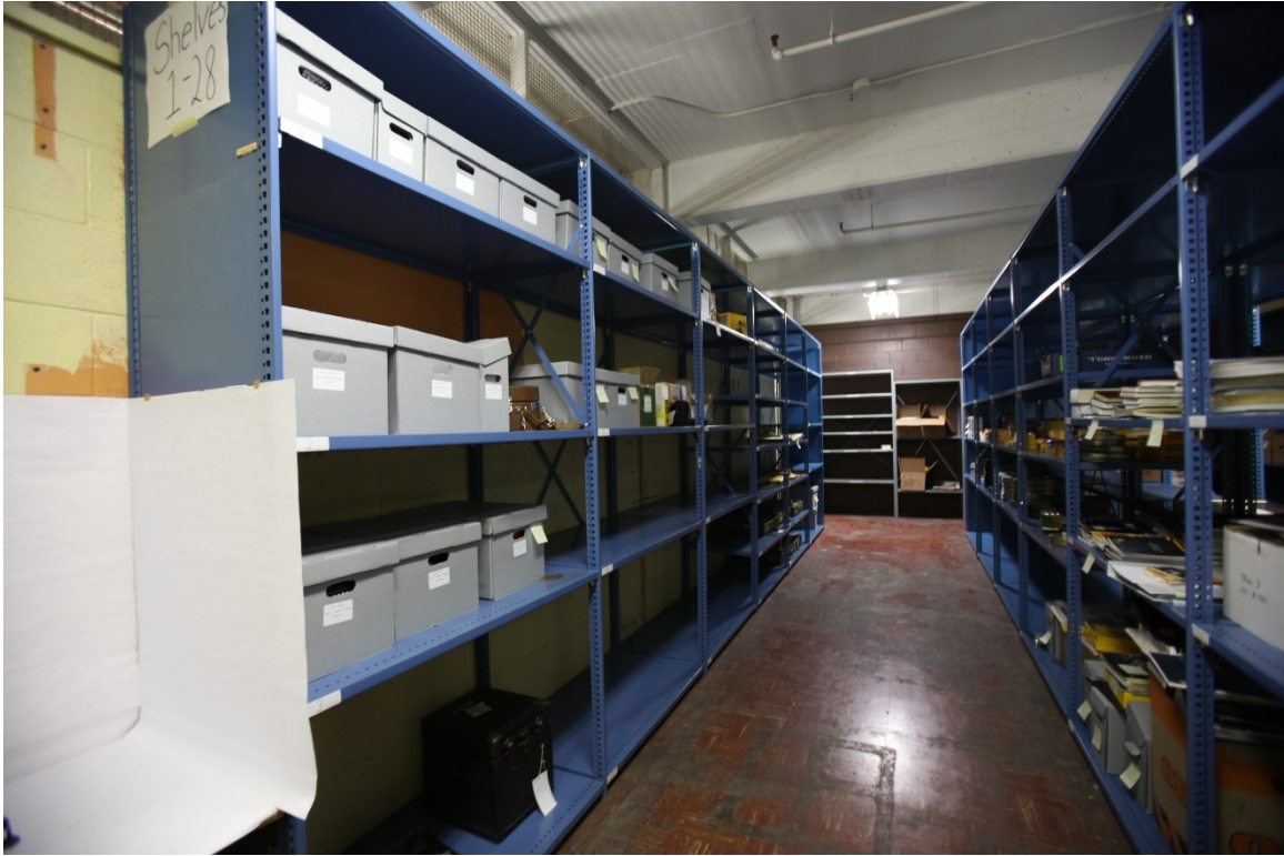
Fig. 5: The camera collection (left), rehoused into archival quality boxes. Photograph by Alexandra Serpikov, January 2017.