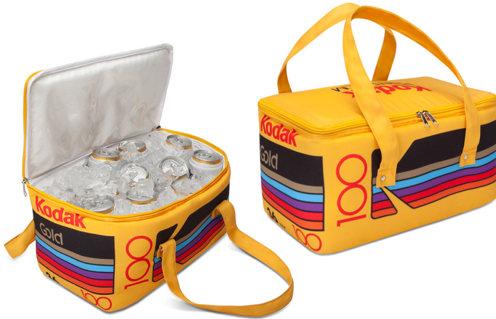
Fig. 9: Vintage Kodak Cooler from the KODAK Collection.