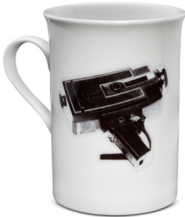
Fig. 11: Super 8 Camera mug, from the KODAK Collection.