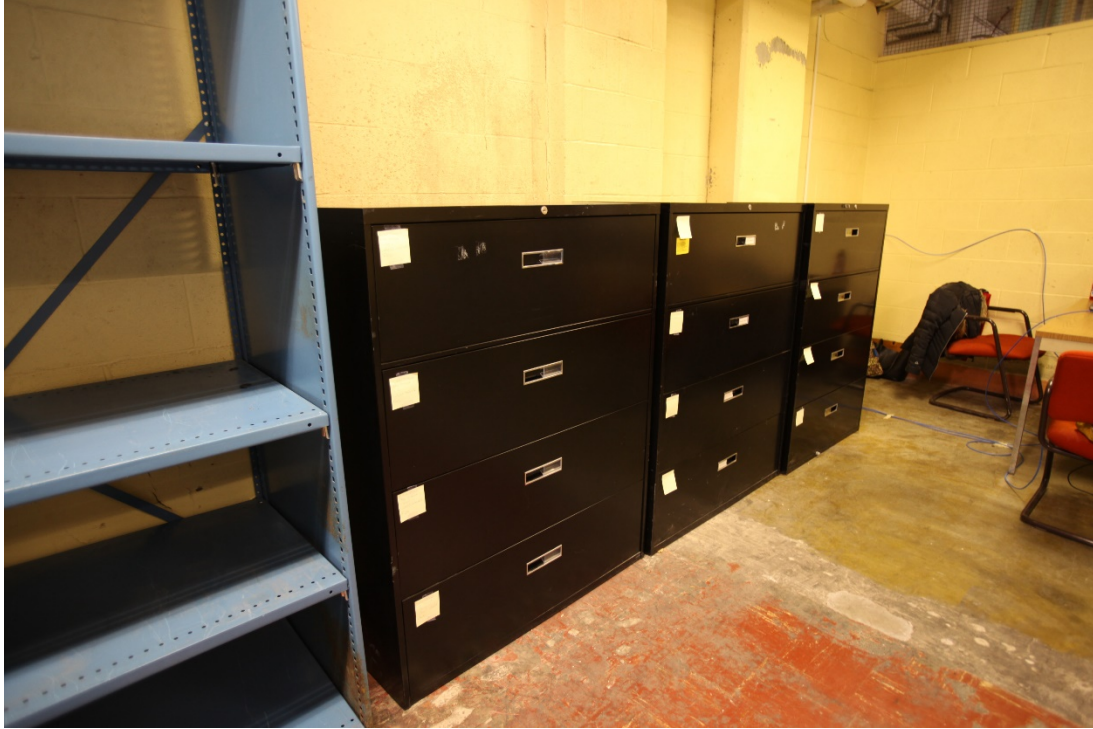
Fig. 7: File cabinets housing paper records. As of June 2017, more cabinets were installed in the archive room.

Photograph by Alexandra Serpikov, January 2017.