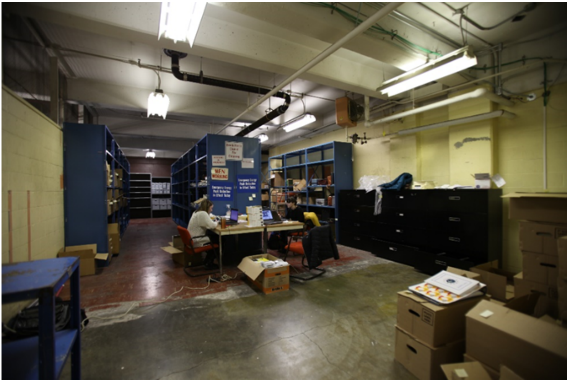
Fig. 3: The Kodak Archive space in Building 28, during the first week of the project. The author, left, and Katie Curran pictured in the process of inventorying the collection. Photograph by Alexandra Serpikov, January 2017.