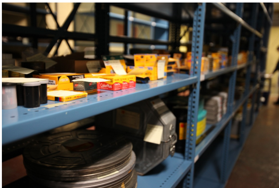
Fig. 2: Some of the film from the collection, awaiting rehousing. Photograph by Alexandra Serpikov, January 2017.