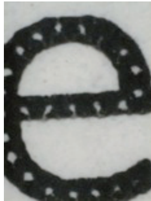
Figure 3. Spranq lowercase e

It is evident that Times New Roman saves the most ink—even more than Century Gothic, the typeface chosen by University of Wisconsin Green Bay. After analyzing these fonts, it was decided that, though Times New Roman saves the most ink, the research should investigate sans-serif fonts because of their contemporary popularity and connotations of a clean, technical look appropriate to an institute of technology. Additionally, sans-serif fonts are easier to modify because they have less visual data to accommodate than serifed fonts. Because Helvetica and Arial were the highest in ink consumption, the goal was to find a sans-serif design that would have a similar graphical look and connotation, yet use less ink. First, other fonts specifically created for ink saving were looked at, including EcoFont (Spranq – http://www.ecofont.com ) and InkSaver (Scriptorium – http://www.fontcraft.com ). Figures 3 and 4 show the printed version of letters e and r using the Spranq font at 8pt. Figures 5 and 6 show the printed version of letters e and r using the Ink Saver font at 8pt.