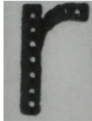
Figure 4. Spranq lowercase r