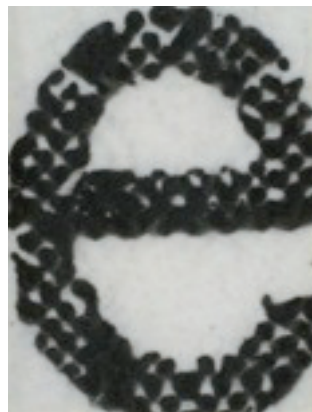
Figure 5. Ink Saver lowercase e