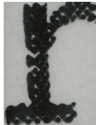
Figure 6. Ink Saver lowercase r

These fonts save on ink by placing holes or striations within the text, but user testing performed for this study suggested that both were objectionable in terms of congeniality (the pleasure of reading). That is, readers seemed to feel that the fonts looked “gray” or were inferior in image quality. A font of more traditional form was sought that could, if necessary, be modified to achieve ink savings.