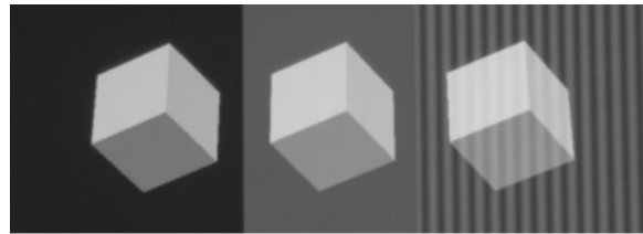
Fig. 1 Photograph of three identical cubes rendered in an OST AR against different backgrounds: dark-solid, light-solid, light-patterned (from left to right).

Three identical cubes are presented in optical see-through (OST) AR against different backgrounds (Fig.1). The background blending gives the identical cubes different appearances. The increased background luminance increases the overall cube brightness, but