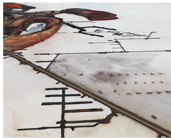
Fig. 8: Burtynsky, Edward. Silver Lake Operations #16, Lake Lefroy, Western Australia, 2007.