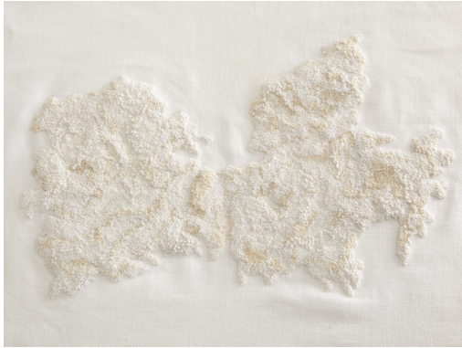
Fig.4: Tavern, Amy., Island of 14,264 Days

days I had lived when I completed the piece, as the island itself established a place of existence and home for me.” 1