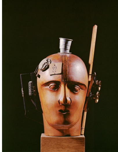
Fig 3: Raoul Hausmann, Mechanical Head (The Spirit of our Time), 1920

Each of these objects were combined with various techniques, but all had a specific reason for being used in the work and attributed to Hausmann's concept and his reaction to the society he was living in, post WWI. The use of alternative materials to speak on relevant issues, including war, was more effective than other forms of artistic expression during this time because of the found objects' ability to hold pre-existing perceptions. While the portrait was a close focus in the art world, Hausmann's use of a model head expanded the ideal expectations of portraiture. Found objects were adhered to the wooden head and represented literal thoughts. The use of these materials through assemblage spoke more deeply to me as a viewer than when I was experiencing a two dimensional piece of artwork. This artistic encounter with found objects and discarded materials became a focus in my practice.