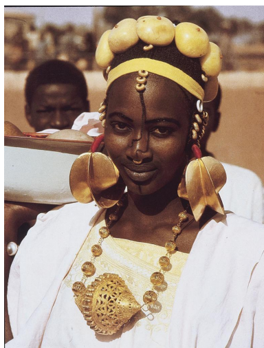
Fig. 1: African woman wearing Bicone pendants and other traditional jewelry.

Today, adornment is widely seen as a form of self-expression and plays an important role in identity. This concept has been proven in history through adornment ranging from tribal jewelry used in rituals, to heirloom pieces signifying power and status (Fig. 1-2). When worn on the body, jewelry becomes a representation of the person wearing it. It accurately reflects their daily habits, style, and even personality.