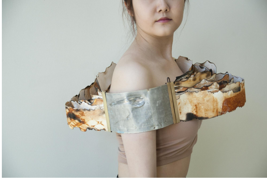
Harvest Shoulder piece