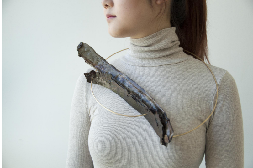
Edge, Neck and Wall piece Found component, bronze

Unable to identify the found strip of steel with embedded rubber, I was faced with another situation of creative freedom. This time I studied the piece closely and pulled inspiration from the features already included. So much detail can be seen in the discarded strip, ranging from color variations reminding me of the foamy space where water meets land, to flaking particles imitating the rocky edge of a cliff. Similar to the Scape neck piece, a rust print was displayed behind this piece as a backdrop to further allude to its relationship with landscape. The found segment felt adequate enough to stand on its own, and in an attempt to keep the content minimal and the focus on the layered ribbon of corroding material, a round bronze frame was added, making the finished work a wall piece, or a wearable necklace. Because of the versatility in the found object and the broad sense of relevance, I do not feel as though this piece is strictly a wearable object, or only a wall piece, but a composition that can be adopted and considered by the individual viewer.