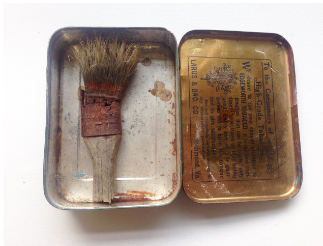
Fig. 9 Found paintbrush and tin

Burtynsky's images often have an eerie sense of non-identifiability, which I found to be similar to some objects I picked up. I found myself looking to Burtynsky's photographs for compositional inspiration and often sketched scenes of places that triggered in my memory when viewing his photographs (Fig. 7-8). To me, images of these unfamiliar lands resembled the curbside gutters and median strips on busy roads or scattered puddles in the forest, which collected bugs and sometimes trash. Forgotten places like these are where I found most of the decaying components used in my work. Elements such as lacquer barely holding onto a steel beam and bits of rusted grates worn so thin they were on the brink of collapse became my most treasured findings. One of my favorite pieces was a paintbrush that has been decaying at the bind, bristles barely still attached. After I uncovered this discovery from a few layers of dirt, I imagined all the uses it could have once had. Completely unique and custom to its own handlings, my most prominent reason for keeping it is the fact that nowhere else in the world will there be an exact replica. Although this brush did not become part of a wearable piece, nor was displayed in the exhibition, RePlace , it sits in a tin on my shelf, as any prized possession would (Fig. 9).