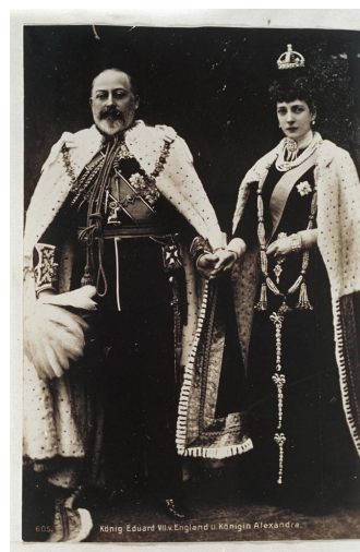
Fig. 2: King Edward VII and Queen Alexandra in royal dress and adornment.

Through its ranges of purpose in history, it is known that jewelry is typically composed of precious materials. If a material or object is so treasured and important that it is used within jewelry, and worn as a form of self-expression, it is assumed that piece is valuable in some way.