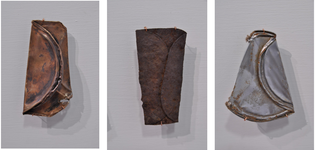
Folded Study Found Components, bronze

Because of the vast methods of research and experimentation completed leading up to the finished works, I ended with several pieces that were not wearable objects, but instead, studies of materials and techniques. One of which was a series of three folded objects, two were found and one was created by me. When collecting discarded pieces, I often found things that were similar to each other, but was particularly interested when I found two round objects that were folded and compressed in almost exactly the same formation. In hopes to figure out how these pieces were handled to end up folded so crisply, I decided to recreate the form in my studio space out of metal. During the process, the metal became oxidized, scratched and beaten up. People who would view my process, became confused and couldn't tell which piece I had made and which pieces were found. This was fascinating to me; I was essentially creating a sample that could pass as a discarded, found object. I was doing more than just making something look old and worn, I was hiding my hand as a maker in the craft field and instead, blending into the natural world around me. Although this series was not a wearable piece, and the concept was quite different, I felt it was important to my exploration and included in the final exhibition collection.