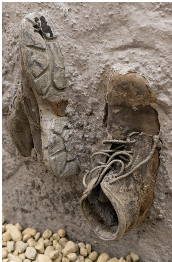
Figure 8. The Luxury Trap: Industrialization-Detail