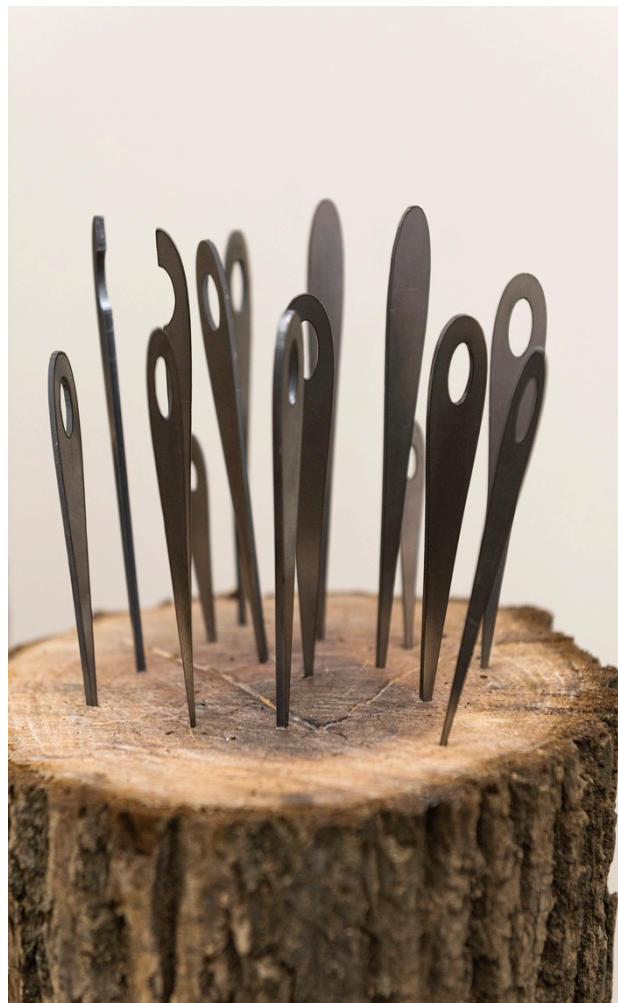
Figure 4. The Luxury Trap: Cognition-Detail