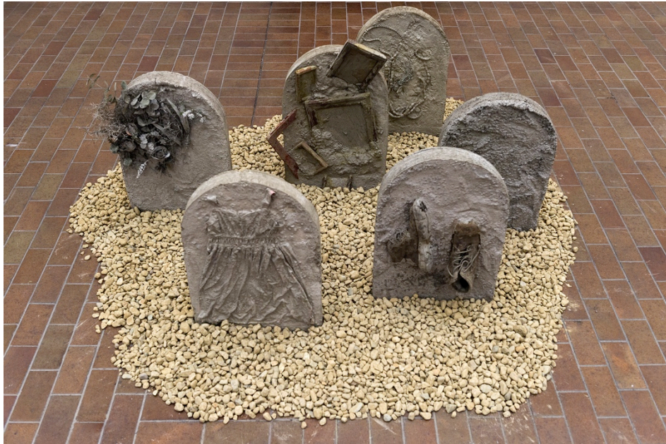
Figure 7. The Luxury Trap: Industrialization