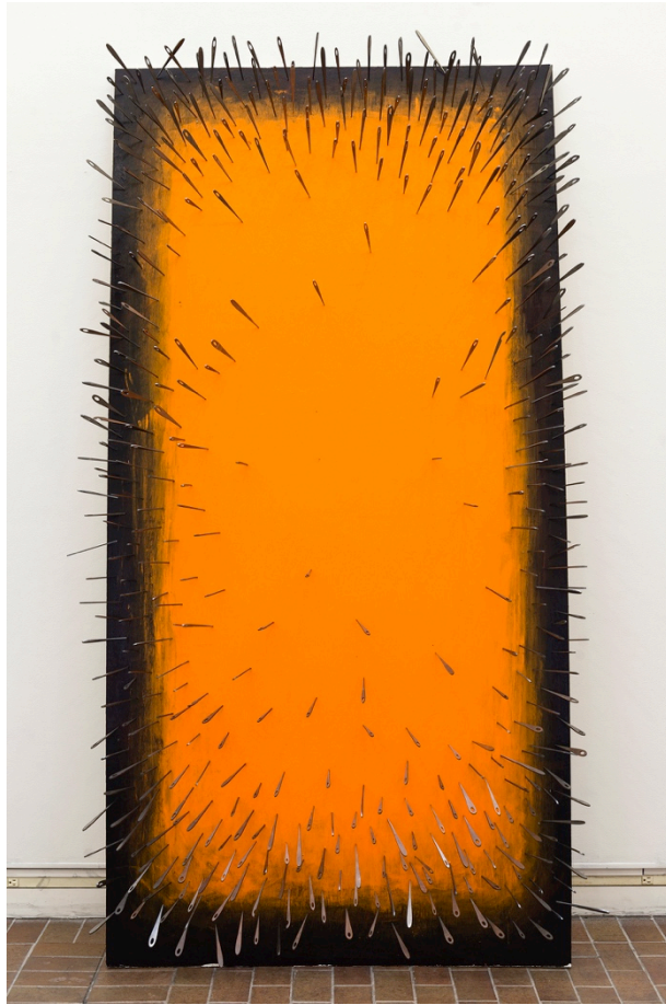
Figure 5. The Luxury Trap: Cognition