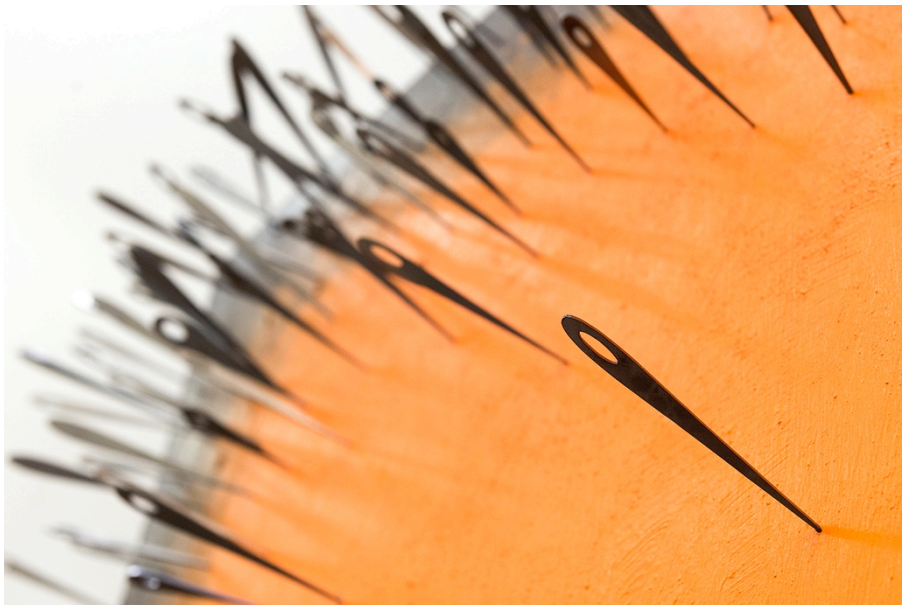
Figure 6. The Luxury Trap: Cognition-Detail