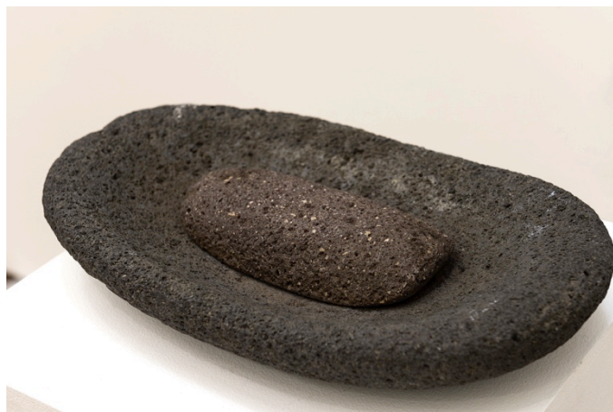
Figure2. The Luxury Trap: Migration-Detail