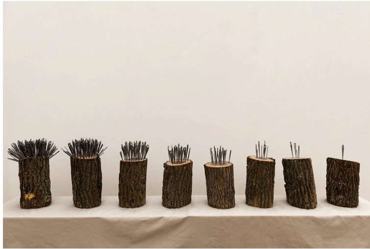
Figure 3. The Luxury Trap: Cognition