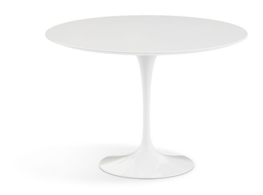
Fig 4. Eero Saarinen Tulip Table