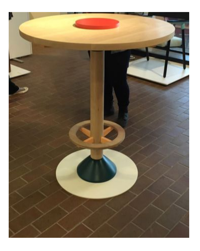
Fig. .3 Mable Bar Table, 2016, maple, steel paint L 36" x W 36" x H 42"

well-suited for both a residential setting as well as a commercial setting, such as a restaurant or a bar.