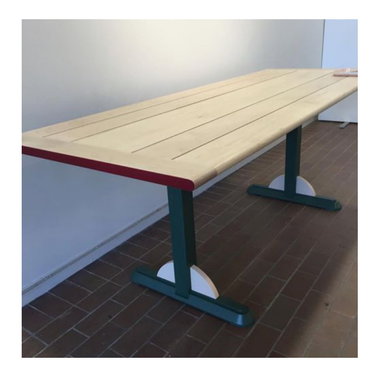
Fig. 5. Ludwig Dining Table, 2016, maple, poplar, paint L 80" x W 32" x H 30"

rejecting functionalism". (Sarnitz 10). The Ludwig table was designed using his works as inspiration, as well as some of the major motifs from the Art Deco period. Once again, I aimed to keep an awareness of past periods while presenting my views in a contemporary context.