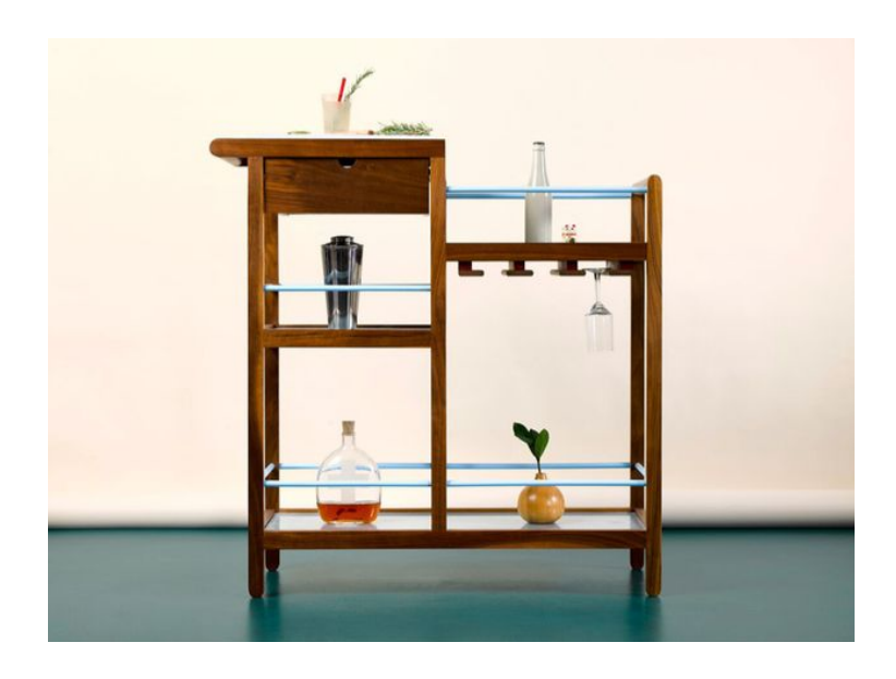
Fig. 2. Ada Bar Cart, 2015, Walnut, Maple, Paint, Glass, Corian, Cork L 41" x W 26" x H 38 1/2"

Beyond the inclusion of important functional components, the visual direction was heavily considered as I knew it would likely lay the path for each successive piece in my thesis studies. I ultimately chose to simplify the structural form into very linear members, while accenting the termination points and transitional details. American black walnut was the obvious material to use, as it was a subtle reference to mid-century Modern and Danish Design, where walnut was prominently used. From its inception, another goal was to include materials other than wood. This desire was for aesthetic and logical reasons, as well as a respectful nod to the Italian Memphis Design Group who believed in using a combination of modern materials in their works.