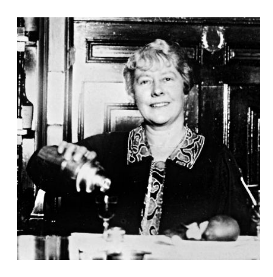
Fig. 1 English Bartender Ada Coleman

My thesis body of work officially began with the Ada Bar Cart, named for the pivotal, early 20th- century London bartender, Ada Coleman (try a <a href="https://example.com/hanky-panky">hanky panky</a> cocktail next time you visit your local craft cocktail bar). As my thesis investigation dealt with the idea of sharing and