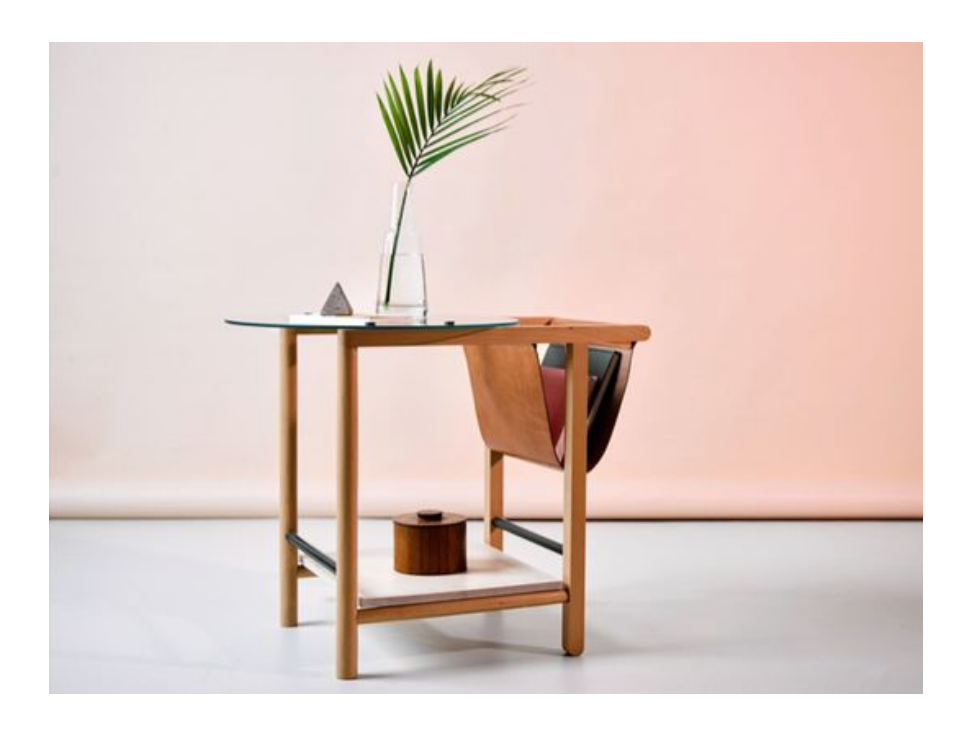
Fig. 6. Hemmy Side Table, 2016, Steamed Beech, glass, leather, pickled maple, paint L 28 1/2" x W 19" x H 22 3/4"

inspiration, I looked to classic British automobile design of the 50s and 60s, specifically the beautiful details of the Aston Martin coupe and Jaguar E-types, referencing their rich, regal colors and fine materials.