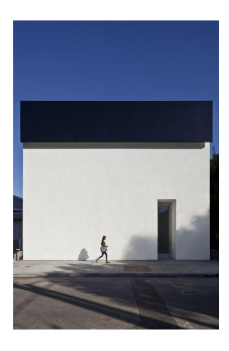
Fig. 8. Black Bar For A Wall by Ellsworth Kelly

Each artist had their own subjects and concepts, although they share some aesthetic similarities. In general, each individual created paintings that deal with large fields of solid colors that build flat picture planes. When translating these ideas into a discussion of design, my eye was drawn to the simple geometric color forms that these painters use to create their "fields". The simple language of the shapes allow for a more easily examined relationship between the chosen colors. I also used these types of simple forms in the hopes of building an accessible yet stimulating visual language.