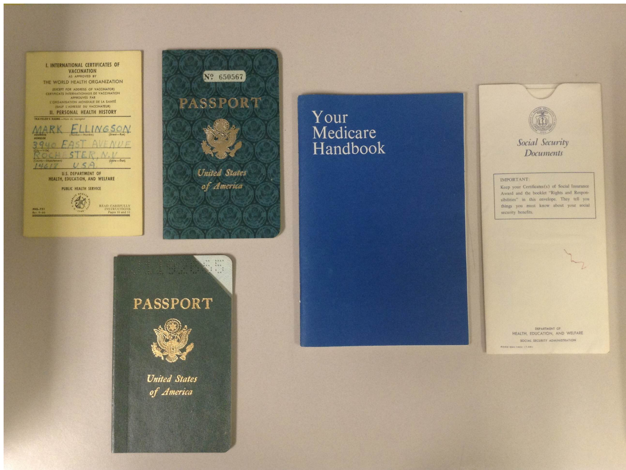
Figure 6. Example of a documents containing personal information about Mark Ellingson suggested for deaccession from the Mark Ellingson Collection.