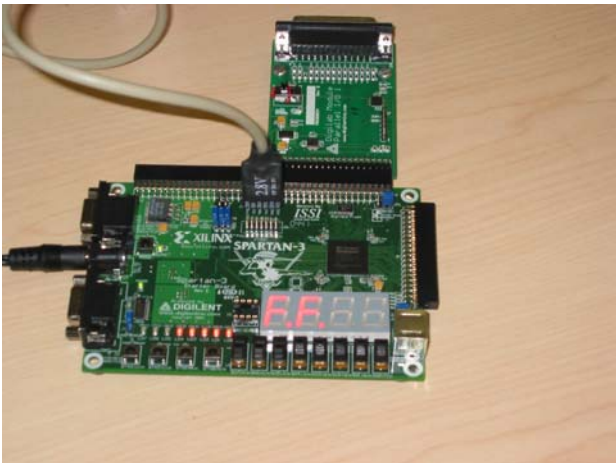
Figure 5 – Digilent Spartan 3 FPGA Board