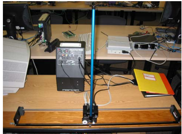
Figure 3 – Quanser System Inverted Pendulum

The last pieces of hardware to mention are primarily used in the third course in the sequence. This course covers performance engineering of real-time and embedded systems. To motivate the need for system tuning of real-time systems we use the control of physical systems. The two systems we choose for the laboratory are from Quanser Systems [8]. We selected their inverted pendulum and ball and balance beam systems shown in Figures 3 and 4 respectively. In the third course the students also experiment with hardware/software co-design on a Digilent Spartan 3 FPGA board [2] shown in Figure 5. There is one FPGA system at each student station.