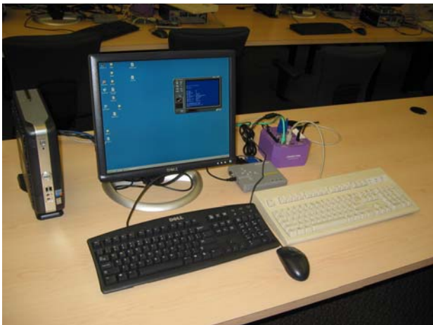
Figure 1 – PC Development environment and Diamond Systems pc-104 board target system showing picture-in-picture target system console.

The studio lab developed for these courses consists of twelve student stations and an instructor's station. The instructor's station is configured with classroom control software that enables the capture, control and display of any of the student stations on the classroom video projector. Each student station is positioned to allow a pair of students to work together. Each station has a modern personal computer for software development and a 486-based single board computer as a target system. We are using a Diamond Systems [1] pc-104 board with timers, A/D converters, D/A converters, and digital I/O capability for the target systems. See Figure 1.