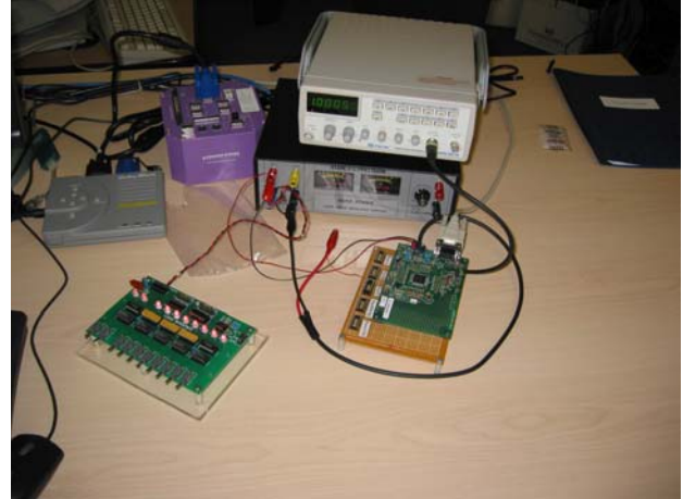
Figure 2 – M68HC12 Microcontroller, interface board, LED-Switch Board, Signal Generator and Power Supply.

For the experiments involving programming a microcontroller, each station is also provided with a Motorola 68HC12 board, a custom designed interface board on which is mounted the microcontroller board, a custom binary LED-switch board for elementary binary input and output, a signal generator and a power supply.