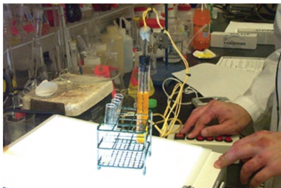
FIGURE 1. Monitoring a color change in a chemical reaction using the SALS and a light box.

photocell that measures light intensity changes. The photocell is encased in a transparent “wand” that is small enough to allow measurements to be made in ordinary test tubes or beakers. The test tube or beaker is placed over a light box or a white reflective surface such as a piece of printer paper, as illustrated in Figure 1. As a reaction proceeds, the varying light intensity at the tip of the sensor wand is converted electronically to an audible tone. The chemical change (e.g., how cloudy or dark the solution becomes) is indicated by a more pronounced change in pitch, usually from high to low. The SALS control box has a memory function that allows reference and data pitches to be stored. It can output these pitches directly or as spoken frequency values.